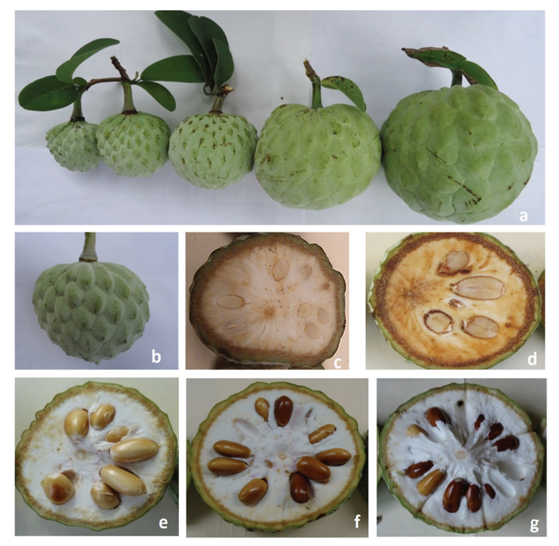
Fig. 1. Fruits in development. A. all stages of development, B-C. First stage (initial harvest, day 0), D. Second stage of development (day 15), E. Third stage (day 30), F. Fourth stage (day 45), G. Fifth stage (day 60).

The external appearance of the unripe seeds infected with larvae in the first instar was similar to the healthy seeds. Both infected and healthy seeds had the same color (dark brown 3/3 according to the Munsell color scale 2009) and did not show visible perforations in the seed coat. However, when dissected, active larvae were found, and the endosperm was partially destroyed by feeding activity (Fig. 3B, Fig. 3C).