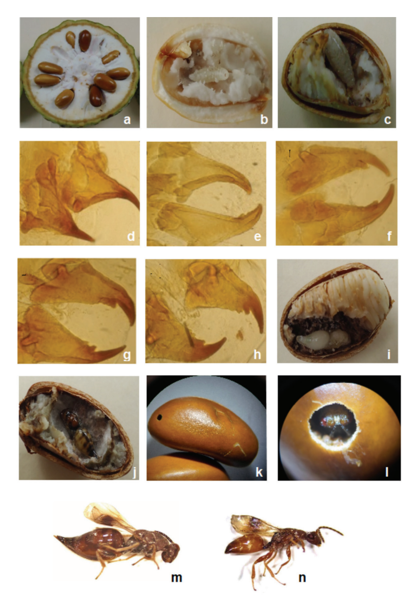
Fig. 3. Development of B. cubensis in the seeds of A. macroprophyllata . A. Seed arrangement in the fruit, B. early larva, C. developed larva, D-H. jaws of the larvae of the five instar, I. early pupa, J. late pupa, K. exit hole of the seeds, L. adult inside the seed, M. adult female, N. adult male.

as adults (Grissell & Schauf, 1990; Castañeda-Vildózola et al., 2010; Hernández-Fuentes et al., 2010; Cham et al., 2019). The presence of B. cubensis in A. macroprophyllata has been reported in some areas of Guerrero and Morelos (Castañeda-Vildózola et al., 2010), but in