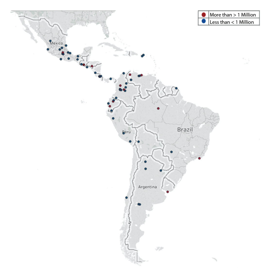
Fig. 1. Latin American cities (approximate location) included in our study, based on answers from survey participants. Support for research group EIS-UTP.