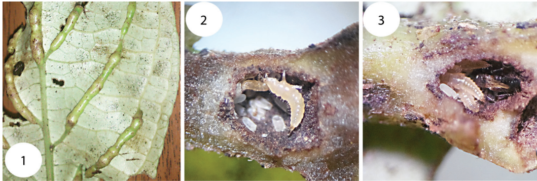
Fig. 1-3. (1). Leaf-vein galls on Piper sp. ( P. epyginium - P. phaneropus - P. umbricula complex): underside of leaf showing galls induced by Zalepidota sp. (Diptera: Cecidomyiidae) [Scale-bar = 5 mm]. (2) Nymph of Holopothrips chaconi in dissected gall [Scale-bar = 2 mm]. (3) Adult, nymphs and eggs of H. chaconi [Scale-bar = 2 mm].

on the plant at least until the next generation of recently abandoned galls becomes available the following year.