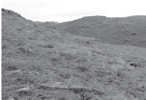
Fig. 2. Typical grassland slope in the “Ernesto Tornquist” Provincial Park where the array of pitfall traps was located.

Spider collection: Spiders were sampled bimonthly using pitfall traps between September 2009-2010 (first year), and March 2011-2012 (second year). A total of 10 traps were placed every 10m along a transect of 100m parallel to the longest axis of a grassland slope with native vegetation (Fig. 2). Pitfall traps consisted of cylindrical plastic recipients of 23cm in diameter and 15cm high buried and covered with a plastic roof sustained by three metallic rods at 15cm from the soil. They were filled with 1 500mL of ethylene glycol, which prevented evaporation and acted as a preservative. All traps were examined and refilled every 60 days period. Voucher specimens were deposited in the arachnological collection of the Laboratorio de Zoología de Invertebrados