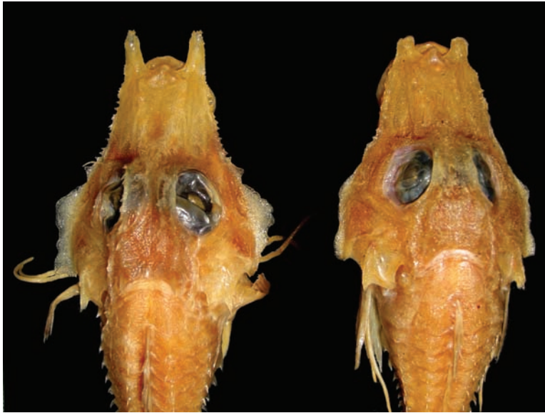
Fig. 3. Dorsal view of heads of Peristedion crustosum , LACM 20838, from Islas Galápagos (left side); holotype of Peristedion nesium , n. sp. from Isla del Coco (right side).