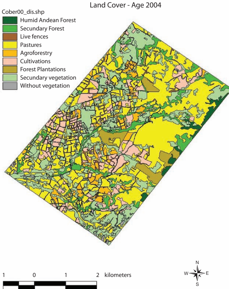
Fig. 1. Vegetation coverage map for 2004 in the Cane-Igaque region.