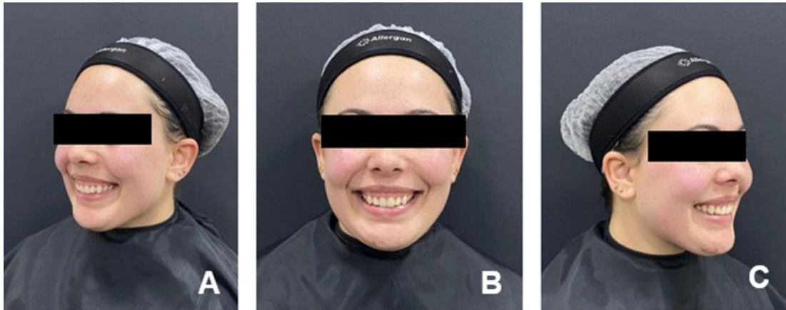
Figure 1. Initial clinical appearance of the smile during the anamnesis A. Left profile B. Frontal C. Right profile.