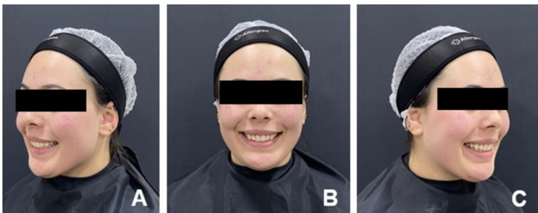
Figure 3. Clinical appearance of the smile 30 days after the procedure: A. Left profile; B. Frontal; C. Right profile.