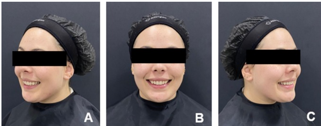
Figure 5. Clinical appearance of the smile 90 days after the procedure: A. Left profile; B. Frontal view; C. Right profile.