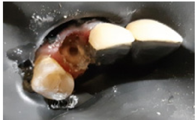
Figure 2. Diagnostic tests and radiographs for the choice of multidisciplinary dental treatment.

When evaluating the case, it is determined to carry out dental treatment with a multidisciplinary approach, which involves endodontics, orthodontics (forced extrusion), periodontics with fibrotomy and prosthetic rehabilitation.