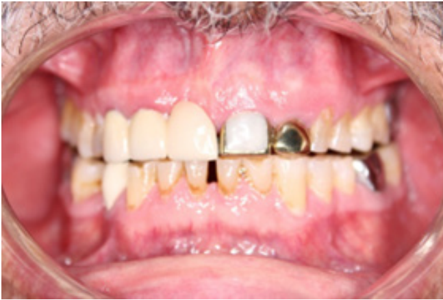
Figure 6. Prosthetic rehabilitation one year after the start of orthodontic treatment.