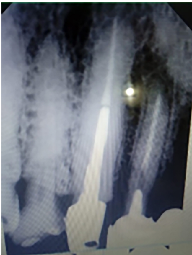
Figure 3.1 Performance of endodontic treatment and placement of endoposte (emptied post).

The activations of the apparatus were carried out every week with metal ligation (0.010), expecting an extrusive movement of 0.5 to 1 mm per week with a force between 15 and 20 grams per activation in addition to the realization of the circumferential supracrestal fibrotomy to help the extrusion and avoid its recurrence.