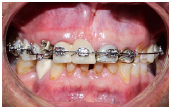
Figure 5. Helix doublers and placement of orthodontic appliances.

Immediately after, a 0.019 x 0.025 rectangular arch made of stainless steel with an extrusion bend was placed at the level of the right upper canine. In the same fold, a helix-type loop was adapted that functioned as a support to place the passive ligature (the cebanda) (Figure 5).