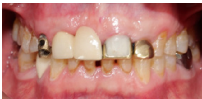
Figure 4. Drilling and cementation of the endoposte. (post casting)

During the control appointments, at three, six, nine and twelve months, the stability of the extruded tooth was evaluated, through palpation of the mucosa, in addition to percussion tests and X-ray taking, mainly verifying the absence of clinical and radiographic signs and symptoms (Figure 6).