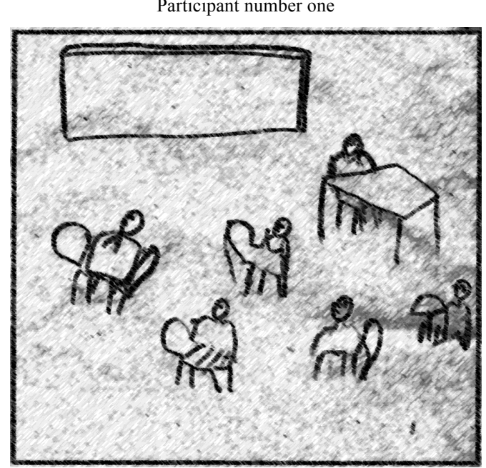
Drawing 1. Participant number one

Thirdly, the participants explained something very positive: "si, representa algo bueno, buena educación" [yes, it represents something, good education].