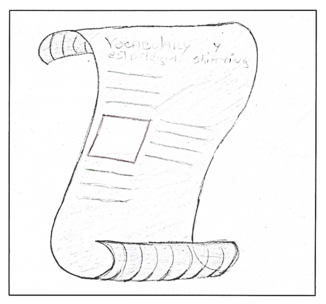
Drawing 3. Participant number three

Regarding the graphic organizers, he mentioned that his drawing represented the following: "Representa lo aprendido y el orden prácticamente" [It presents what we learned and order practically]. In relation to the colors, the student explained: "...los colores representan más que nada colores de la naturaleza ya que en el lugar en el cual estamos no se aprecian muchos colores..." [the colors represent nature mainly, since the place where we are, we do not appreciate colors].