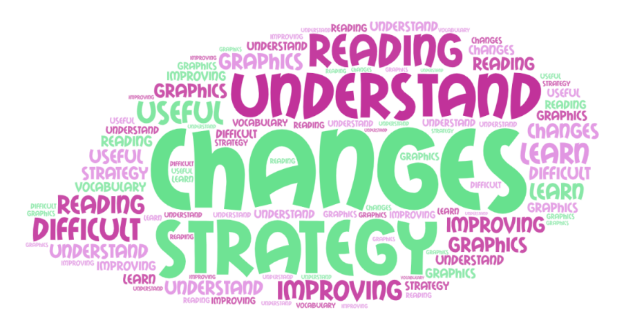
Figure 3. Participants' most frequent concepts regarding their improvements after the pre and post-intervention tests and intervention sessions

P1. "Si, yo logré comprender más. Porque como dije anteriormente, no sabía nada de inglés y ahora sé algo de Inglés, aprendí algo de Inglés. Quiero seguir aprendiendo más Inglés" [Yes, I managed to understand more. Because as I said before, I didn't know any English and now I know some English, I learned some English. I want to continue learning more English].