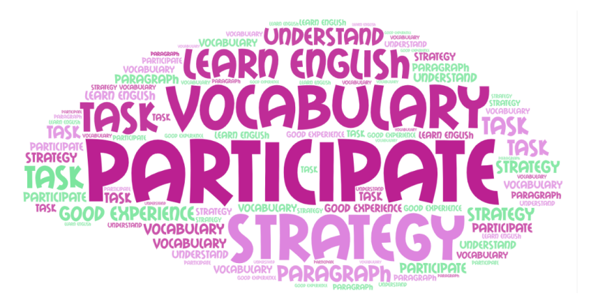
Figure 1. Participants' most frequent concepts about the explicit teaching of the skimming strategy