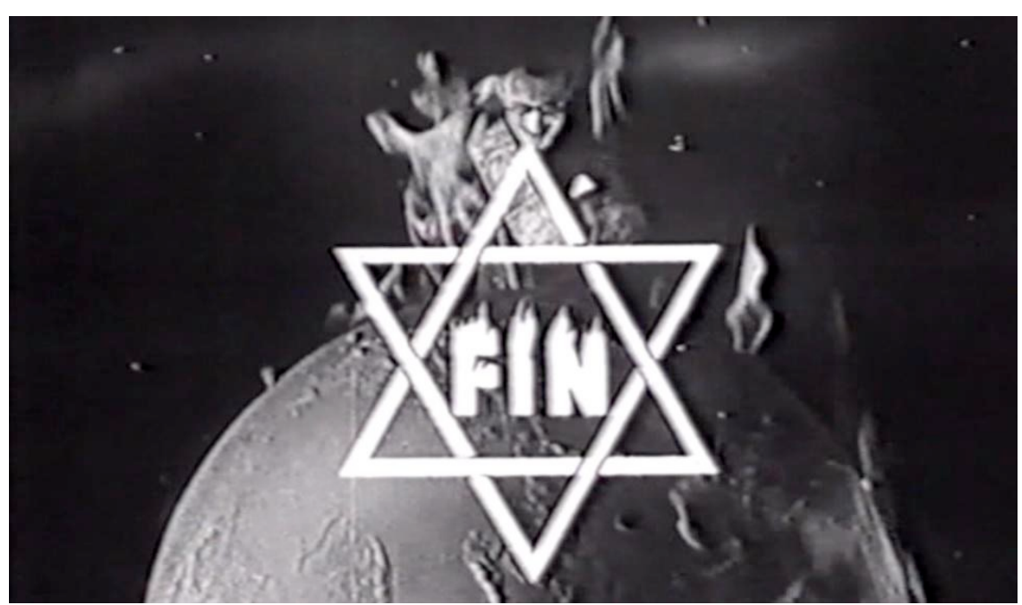
The final image, showing the judeo-masonic victory, hence the triumph of evil.

Important to realize, that this film has the same narrative structure of propaganda as defined by F. Chevassu in the Journal Image et Son (Sound and Image):