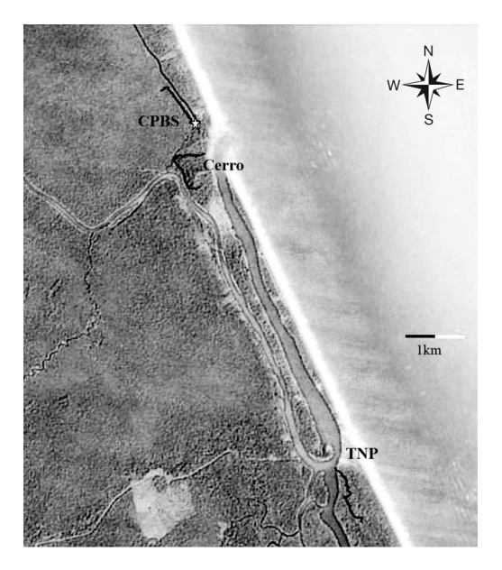
Fig. 1. Study region encompassing the Northern edge of Tortuguero National Park (TNP) and the Southern extreme of the Barra del Colorado Wildlife Refuge including the transects at Caño Palma Biological Station (CPBS) and the Cerro.

Survey protocol: The monitoring protocol followed MacKenzie (2005), using presence/ absence data to determine plot occupancy and density of different species. This design