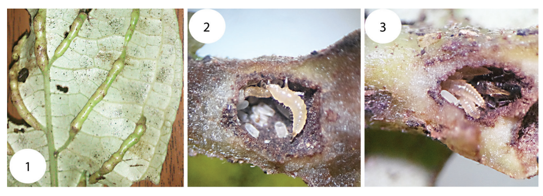
Fig. 1-3. (1). Leaf-vein galls on Piper sp. ( P. epyginium - P. phaneropus - P. umbricula complex): underside of leaf showing galls induced by Zalepidota sp. (Diptera: Cecidomyiidae) [Scale-bar = 5 mm]. (2) Nymph of Holopothrips chaconi in dissected gall [Scale-bar = 2 mm]. (3) Adult, nymphs and eggs of H. chaconi [Scale-bar = 2 mm].

on the plant at least until the next generation of recently abandoned galls becomes available the following year.