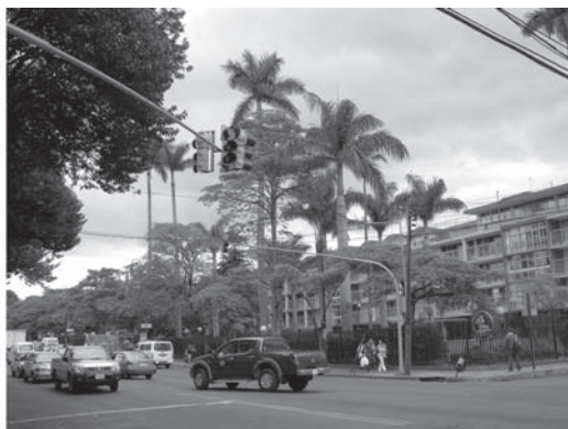
Fig. 1. Images used for the comparison: City of San José, Costa Rica. NOTE: The original images used in the measurements appear in the Internet edition.