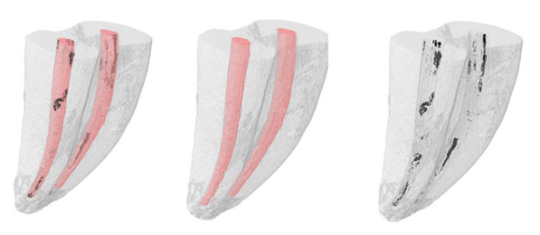
Figure 1 . Representative three-dimensional reconstruction of mesial root canals of mandibular molars obturated by lateral compaction and continuous wave of condensation. Filling material and voids are depicted in pink and black, respectively.