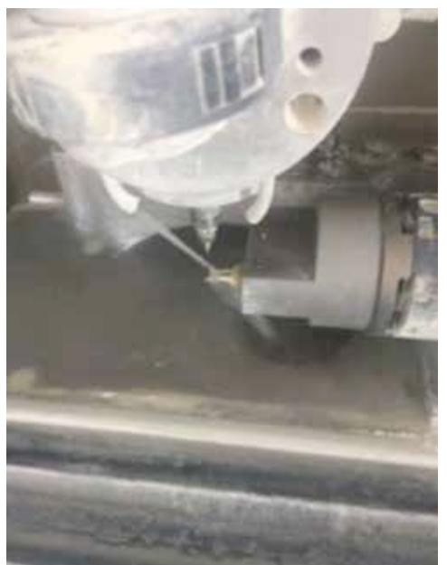
Figure 1 .Closer view of dentin fragment being milled in CAD-CAM milling machine to generate dentin post.

The SEM images of sterilized and non- sterilized dentin of the human and bovine teeth were shown in Fig.4. Notable variations were found among the Cnt, Aut and Rad groups.