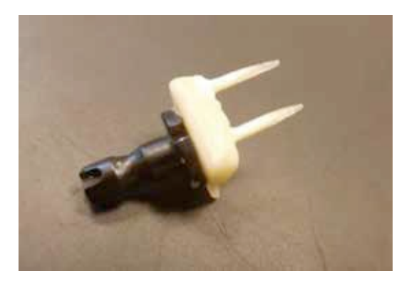
Figure 2. A milled dentin post specimen.