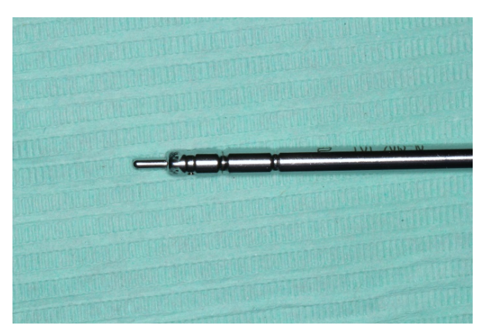
Figure 4. Triple syringe tip coupling