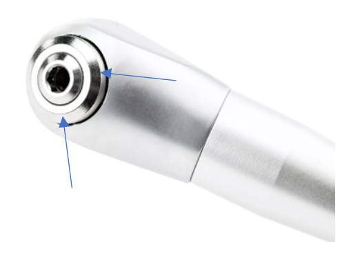
Figure 5. Retractable fastening system, arrows indicate where the ring should be pushed.