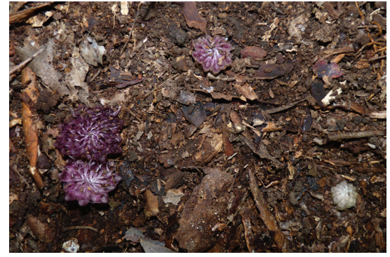
FIGURE 4. A cluster of 4 flowering heads.

RECOGNITION: This new species has large carinate floral bracts ( ca. 16 mm long, ca. 7 mm wide) that subtend the flowers and bright mauve to pinkish-purple flowerheads, each head 9–11 mm long and ca. 5 mm across and bearing 15–35 flowers. The widely-opening flowers have purple-marked tepals 7–9 mm long with long drawn-out filamentous tips and a dark purple-