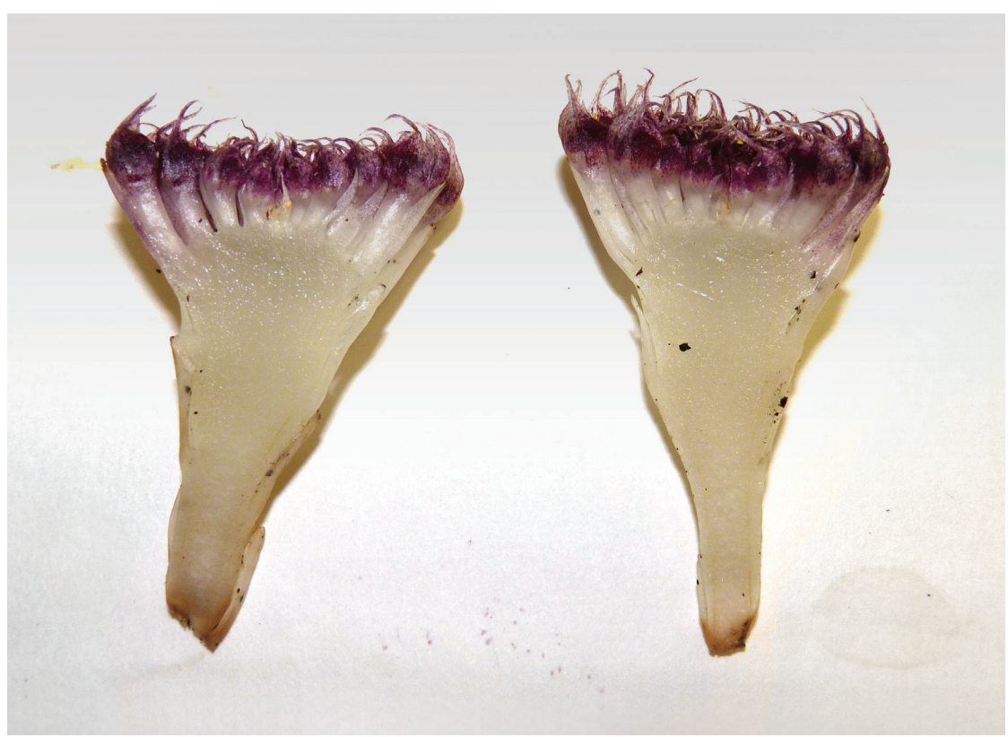
Figure 6. Dissected inflorescence and type of Rhizanthella speciosa.

Conservation status: Known from a single restricted site but conserved in the Barrington Tops National Park. The habitat where it grows is a very widespread and common community in north-eastern New South Wales