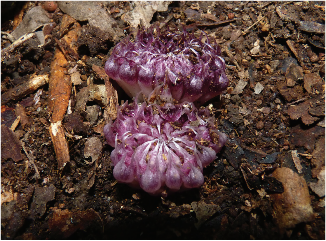
FIGURE 5. Close up of twin inflorescence one of which was collected and was used as type for the new species.

similar growth and floral features they are readily distinguished by a number of characters. By contrast to the new species, R. slateri has smaller floral bracts ( ca. 7 mm long, 3 mm wide) and pink to dark reddish flowerheads, each head with 15–30 flowers which are 6–8 mm long and ca. 3 mm across. The flowers have densely papillate tepals 2–4 mm long with short extended tips and a flat, dark red, broadly heart-shaped papillate labellum ca. 2 mm long and 2 mm wide, with a smooth base. At anthesis the lateral sepals remain in close proximity and no scent is obvious. Ripe drupes are yellow.