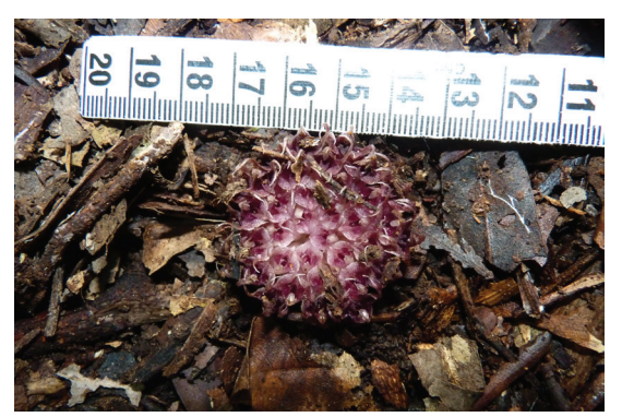
FIGURE 3. Flowering plant in situ with scale.

(Sm.) A.Juss.) and a sparse ground layer in dark clay-loam over metasediments.