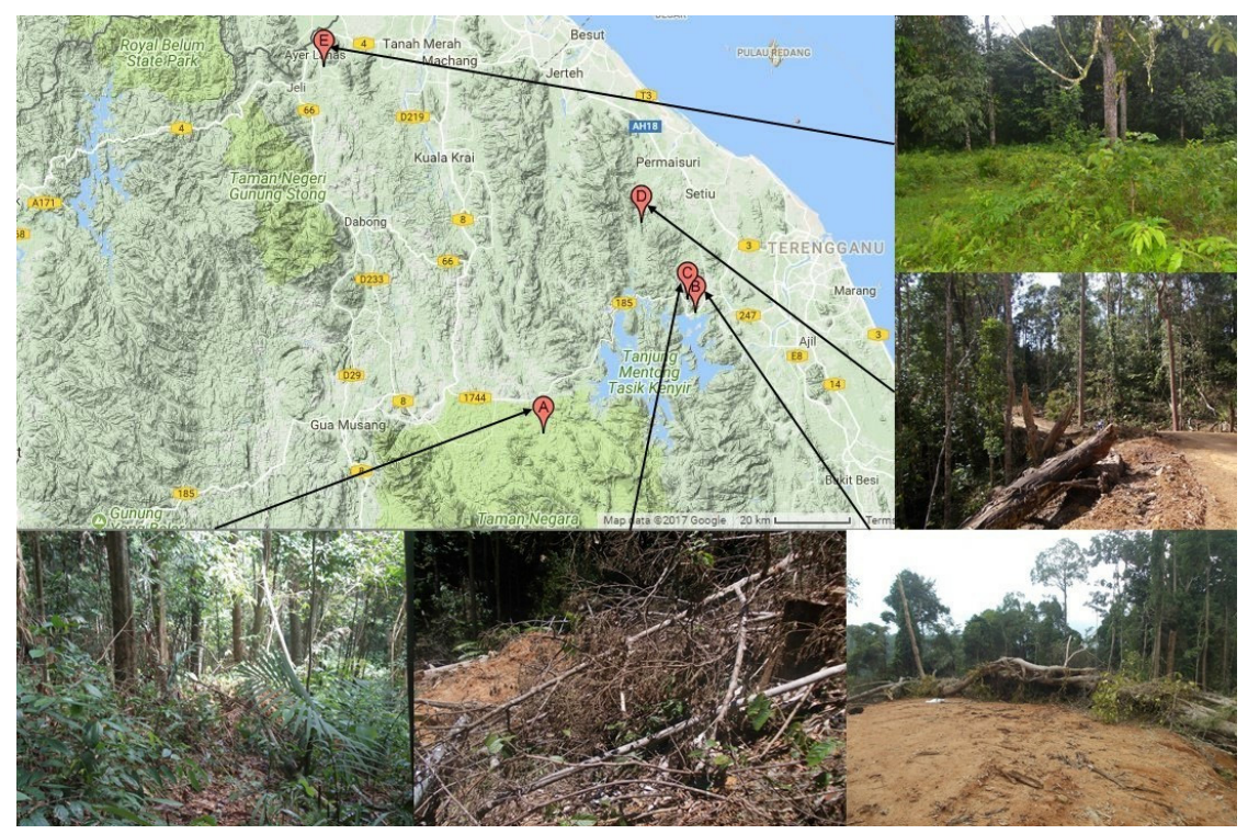
FIGURE 1. Coordinates of each studied site recorded in disturbed forests of Terengganu and Kelantan regions. A. Kuala Koh area (DSFs Site 1). B. Gawi area (Logging Site 1). C. Gawi area (Logging Site 2). D. Petuang area (Logging Site 3). E. Tanah Merah area (DSFs Site 2). The map was adapted from http://www.geoplaner.com, a free web-based application that provides several GIS and GPS services.

of approximately 53,000 m<sup>2</sup>. The total area studied in the logging sites was calculated based on the distance traveled along the logging road in the logging site times the width of 20 m on each side of the road, and the orchids were mostly found on fallen trees.