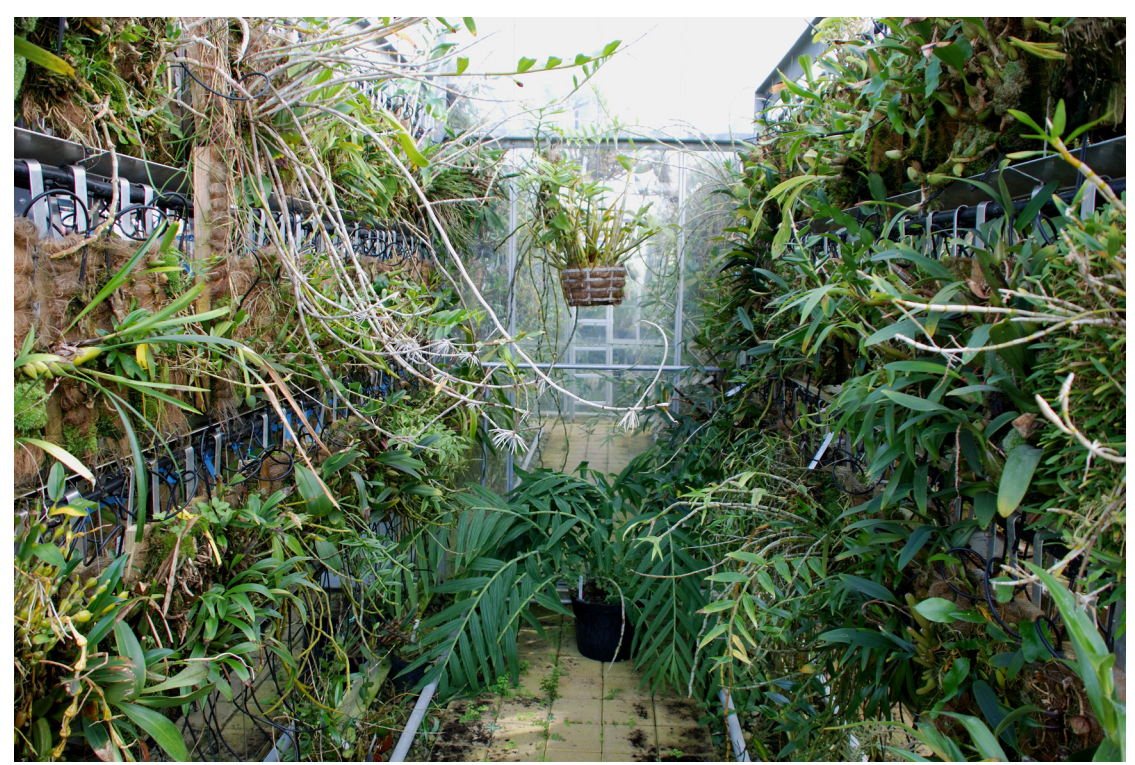
FIGURE 1. The Seidenfaden collection anno 2014 – accommodated in a modern greenhouse donated by the Augustinus Foundation in 2000.

of Copenhagen, around 1959 when Seidenfaden was posted to Moscow as Danish ambassador to the Soviet Union. Upon his return to Denmark in 1961, he was able to resume expedition activities during recurrent visits to Thailand. Consequently, the living collection kept growing until Seidenfaden's last expedition in 1983.