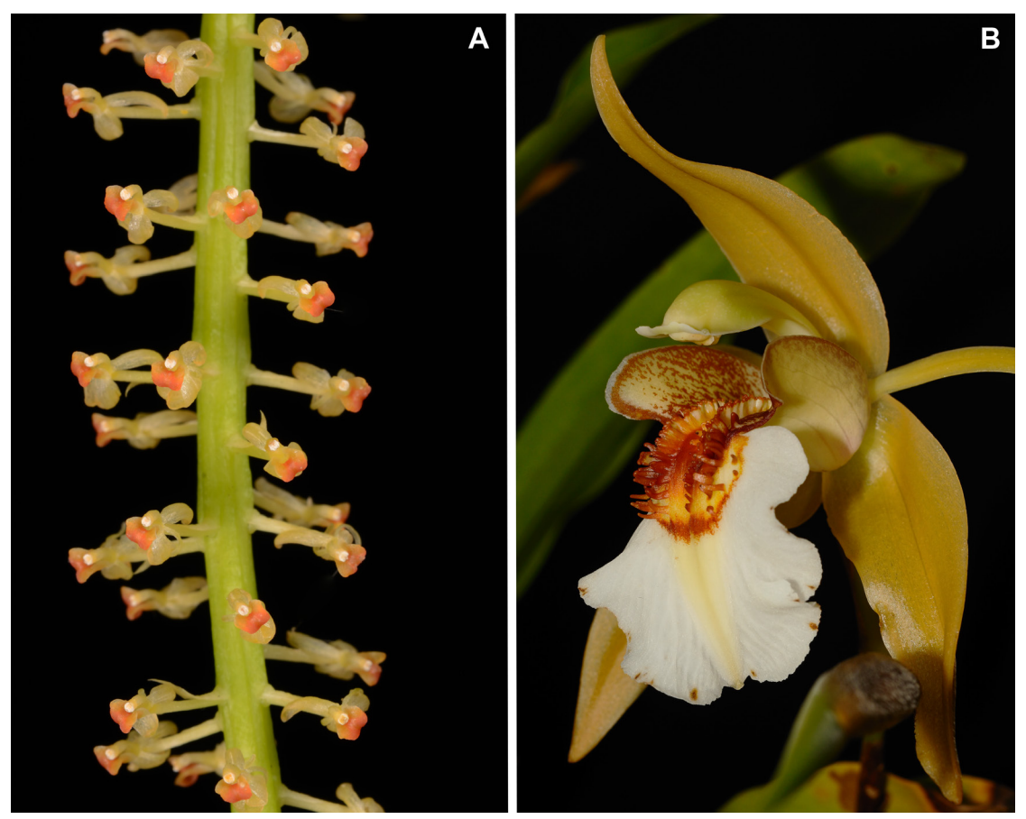
FIGURE 2. The two latest examples of new national records for Thailand revealed in Seidenfaden's living collection; both species are obvious candidates for inclusion in the next edition of the national Thai red-list. A. Liparis vestita Rchb.f. – in Thailand only known from Amphoe Rong Kwang in Phrae and from two sites in Khao Yai National Park (Nakhon Nayok, Prachin Buri). B. Coelogyne lawrenceana Rolfe – in Thailand only known through a single plant collected on Doi Inthanon (Chiang Mai) in 1978.

samples for their phylogenetic studies. However, sampling was standardized considerably in our recent project, as we decided to DNA barcode as many of the identified species as funding would allow. For this purpose, we adopted the officially recommended core-barcode for land plants, supplemented by ITS. We sampled a total of 131 species from the collection, and the prepared barcodes will be made publicly available as soon as possible.