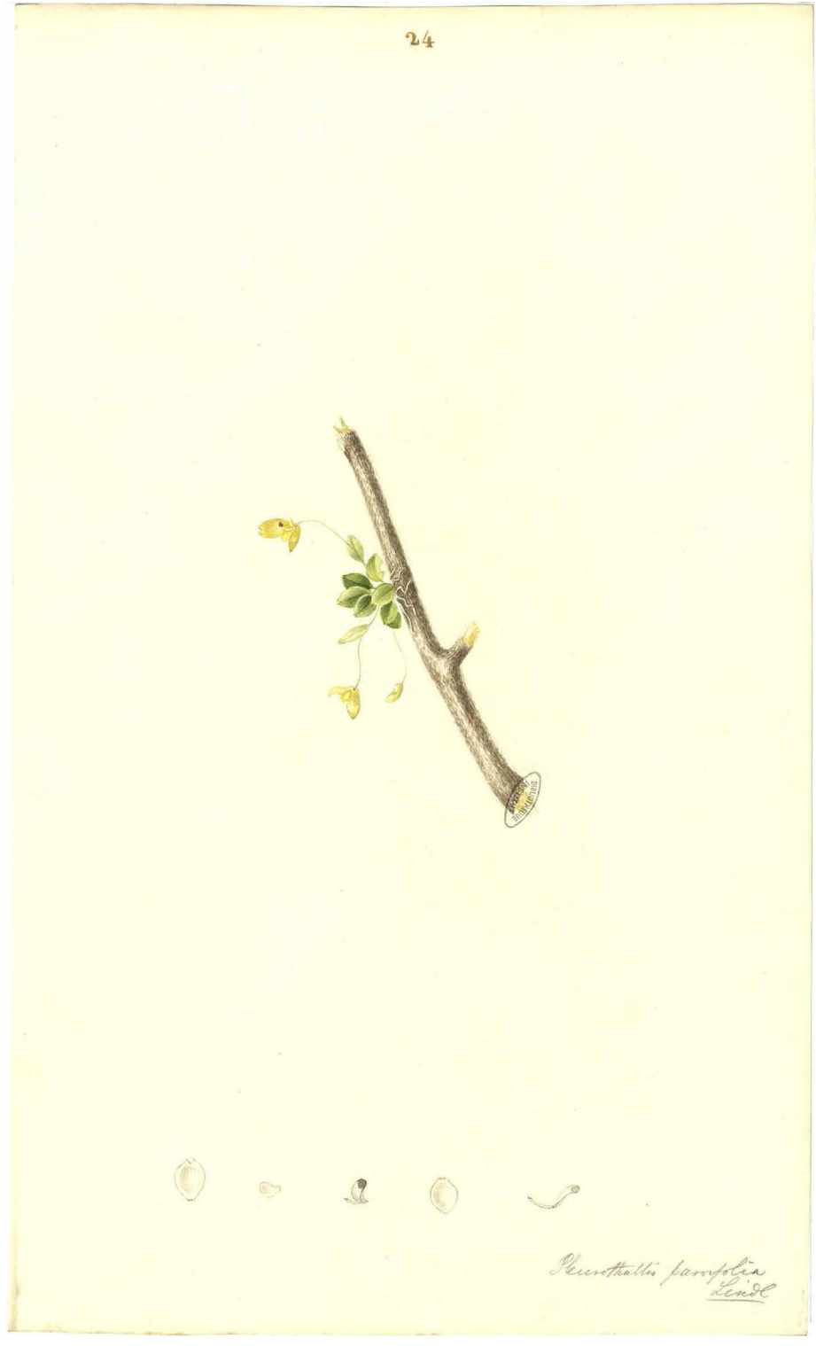
\label{thm:control} \textit{Figure 23. Descourtilz' manuscript. Plate 24: } \textit{Epidendre bilabi\'e-lemnoide} - \textit{Pleurothallis parvifolia}.