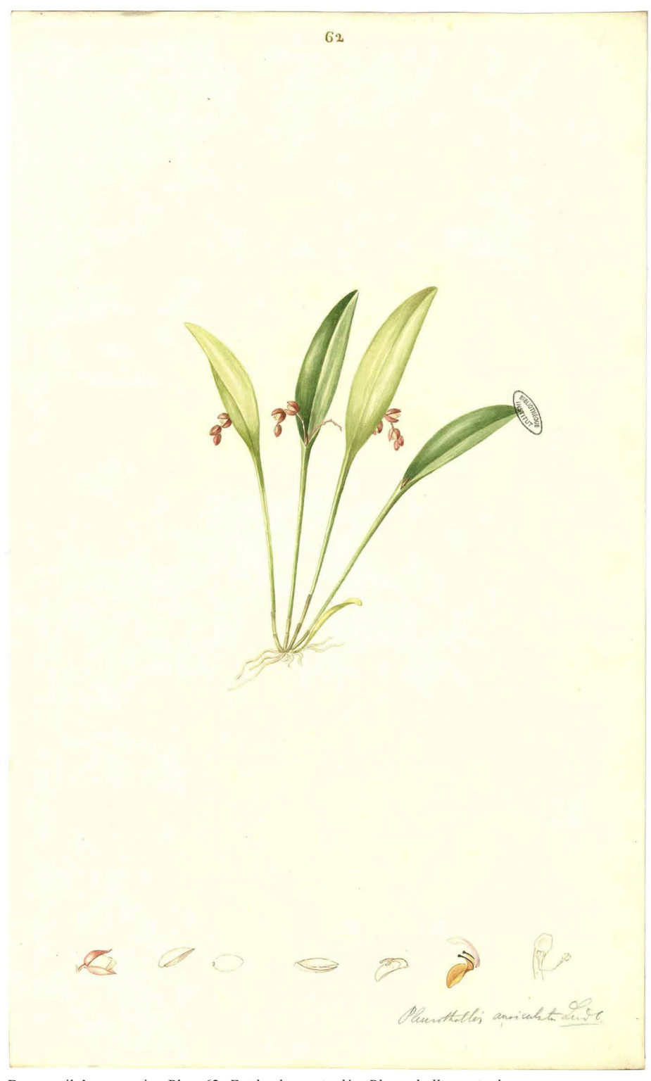
Figure 37. Descourtilz' manuscript. Plate 62: Epidendre auriculé – Pleurothallis auriculata .