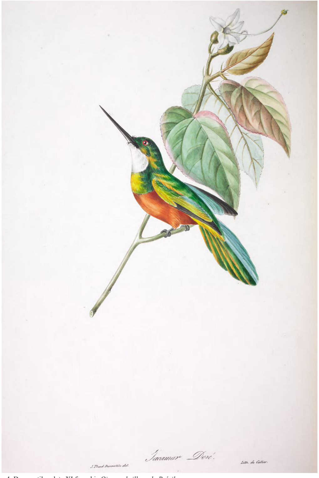
Figure 4. Descourtilz: plate XI from his Oiseaux brillans du Brésil.