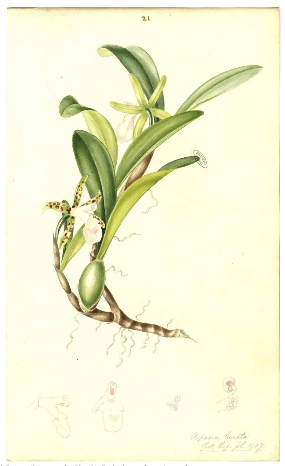
Figure 20. Descourtilz' manuscript. Plate 21: Epidendre tricolore – Aspasia lunata .