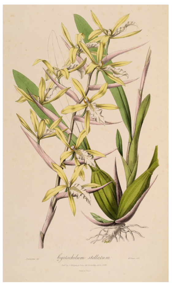
FIGURE 10. Sertum Orchidaceum. Plate 7: Cyrtochilum stellatum.

Delessert. As I have the permission of their liberal proprietor to publish such as are most remarkable in this collection, I shall have frequent occasion to avail myself of its materials, in illustration of the present work."