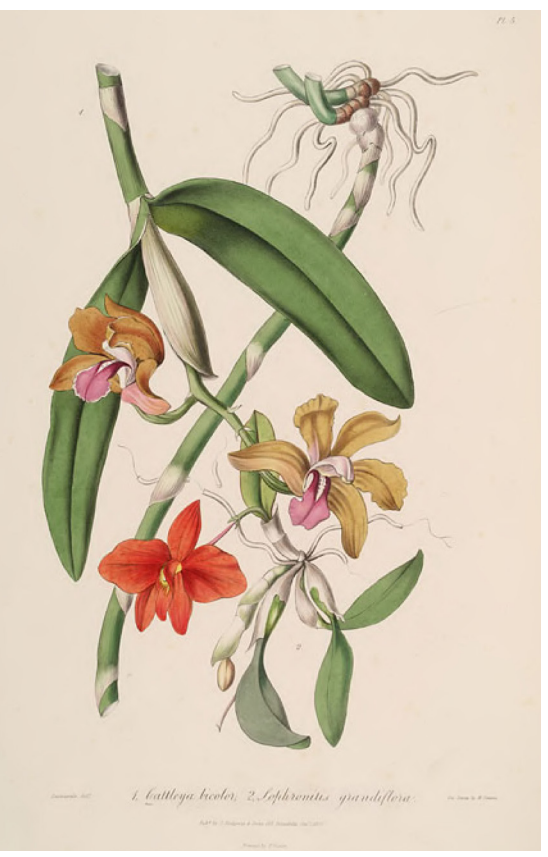
FIGURE 7. Sertum Orchidaceum. Plate 5: Sophronits grandiflora and Cattleya bicolor.

Probably the best proof for the quality of Descourtilz' illustrations lies in Lindley's publication of his Sertum Orchidaceum, a wreath of the most beautiful orchidaceous flowers (1838), one of his most applauded publications (Fig. 7, 10, 12). A book review (Anonymous, 1838: 148-