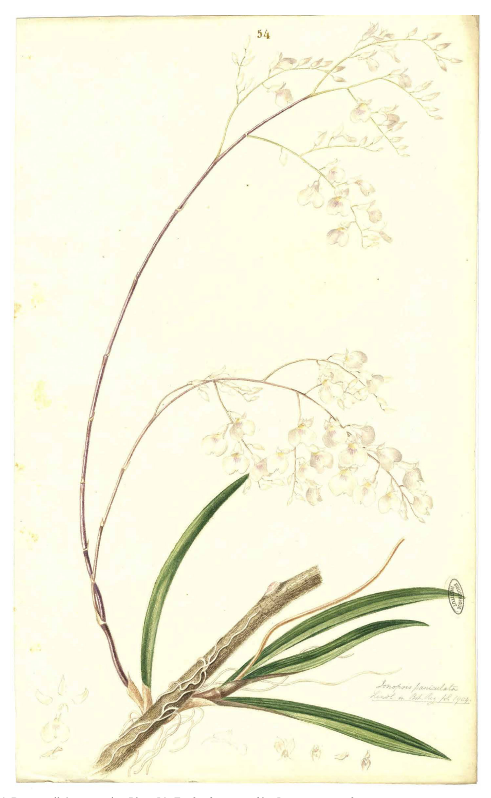
Figure 34. Descourtilz' manuscript. Plate 54: Epidendre paniculé – Ionopsis paniculata .