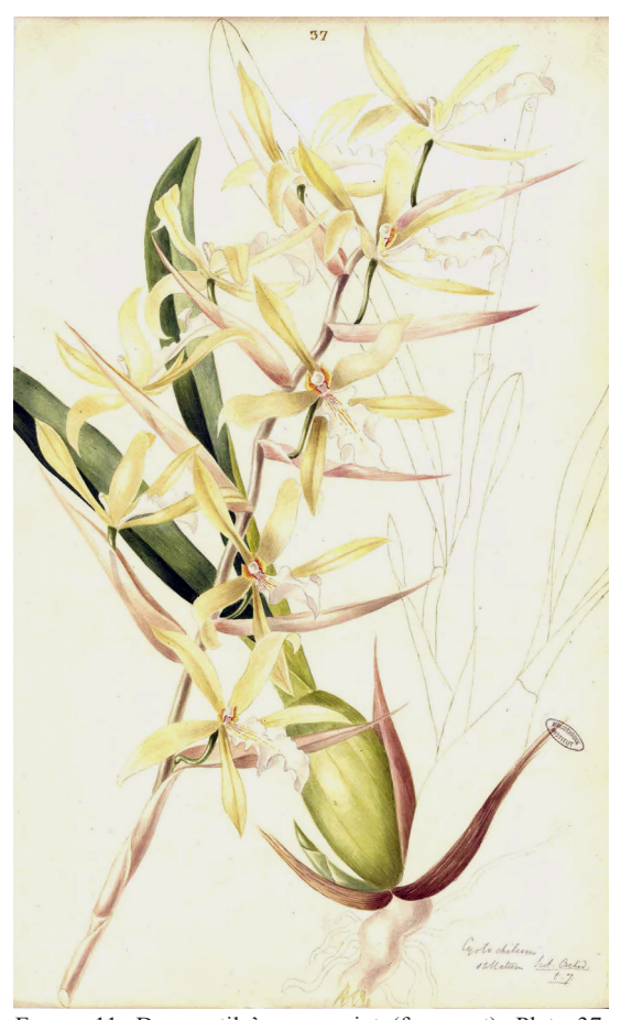
Figure 11. Descourtilz' manuscript (fragment). Plate 37: Epidendre etoilé.

Perhaps the most important contribution of Jean-Théodore Descourtilz to orchidology was the fact that Lindley described no less than 31 new species among the illustrations contained in the manuscript loaned to him by Baron Delessert. Among these we find five species' descriptions in which Lindley mentions specimens by other collectors besides Descourtilz' illustration of the plant, which must therefore be considered a syntype. The remaining 25 illustrations by Descourtilz are holotypes,