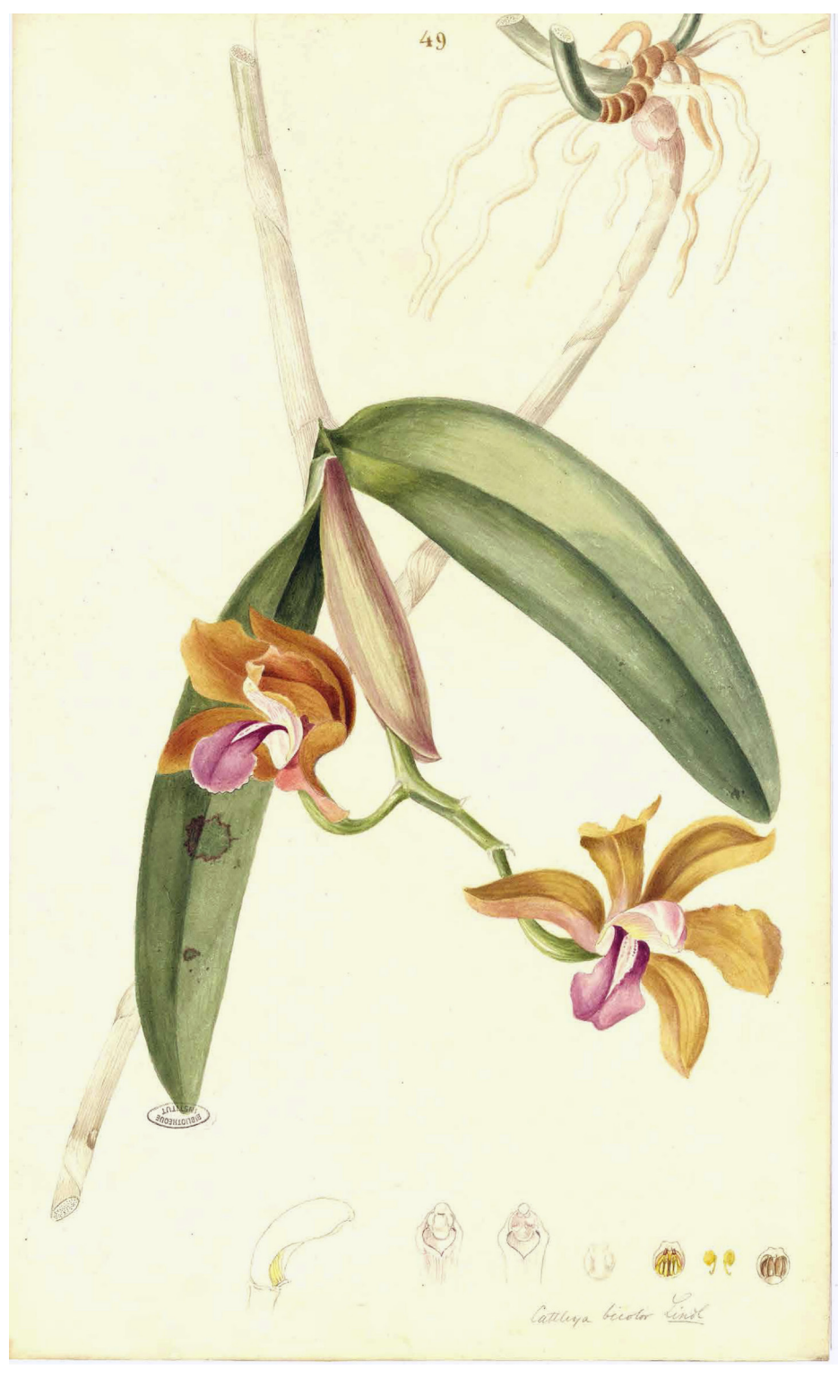
Figure 9. Descourtilz' manuscript (fragment). Plate 49: Epidendre irideé.