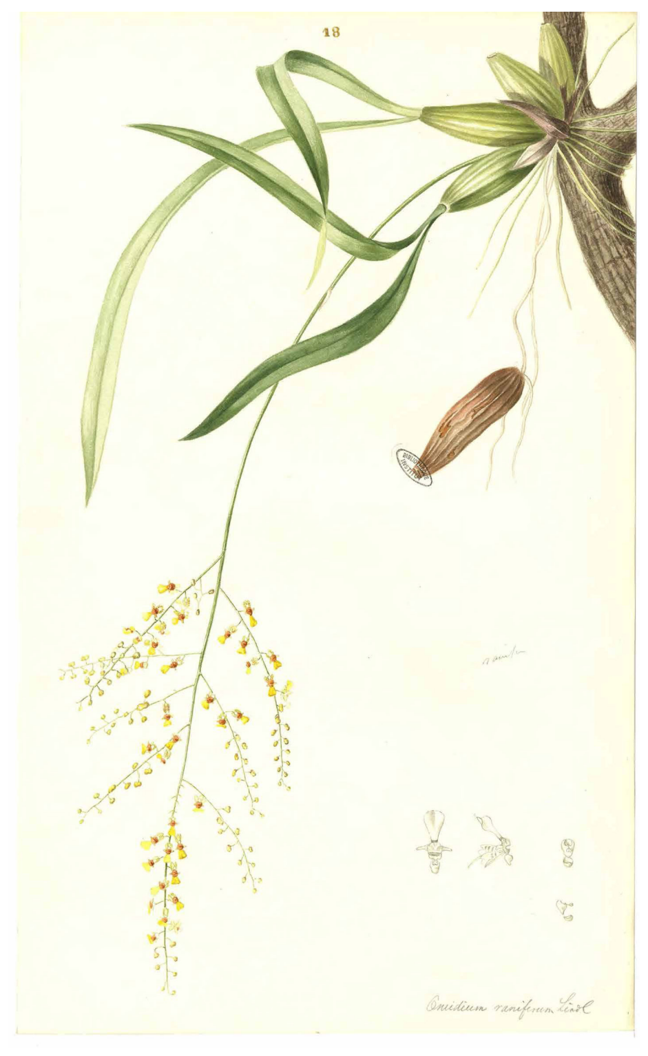
\label{eq:figure 19} \textit{Figure 19. Descourtilz' manuscript. Plate 18:} \textit{Epidendre gramin\'e -- Oncidium raniferum.}