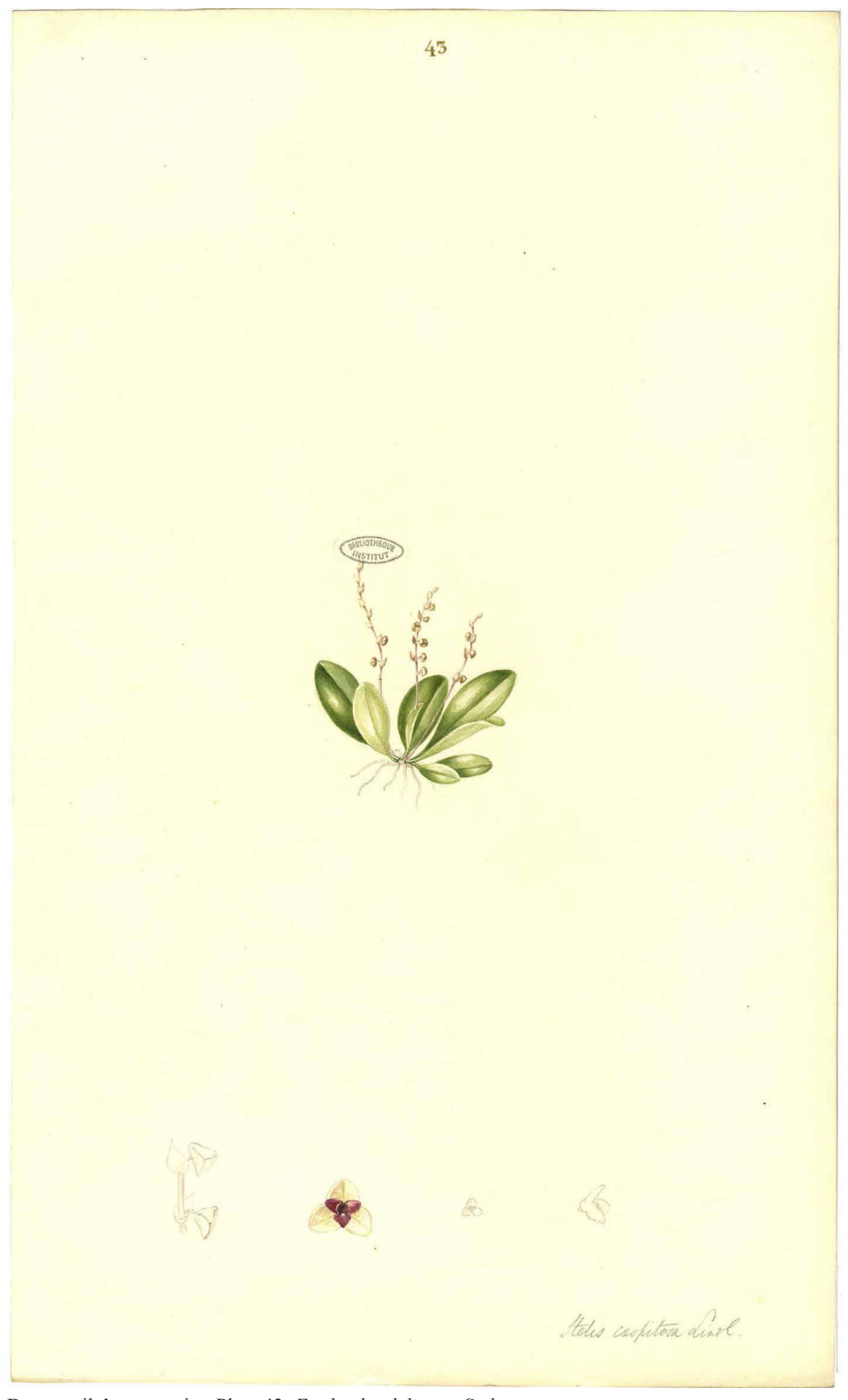
FIGURE 30. Descourtilz' manuscript. Plate 43: Epidendre delicat – Stelis caespitosa.