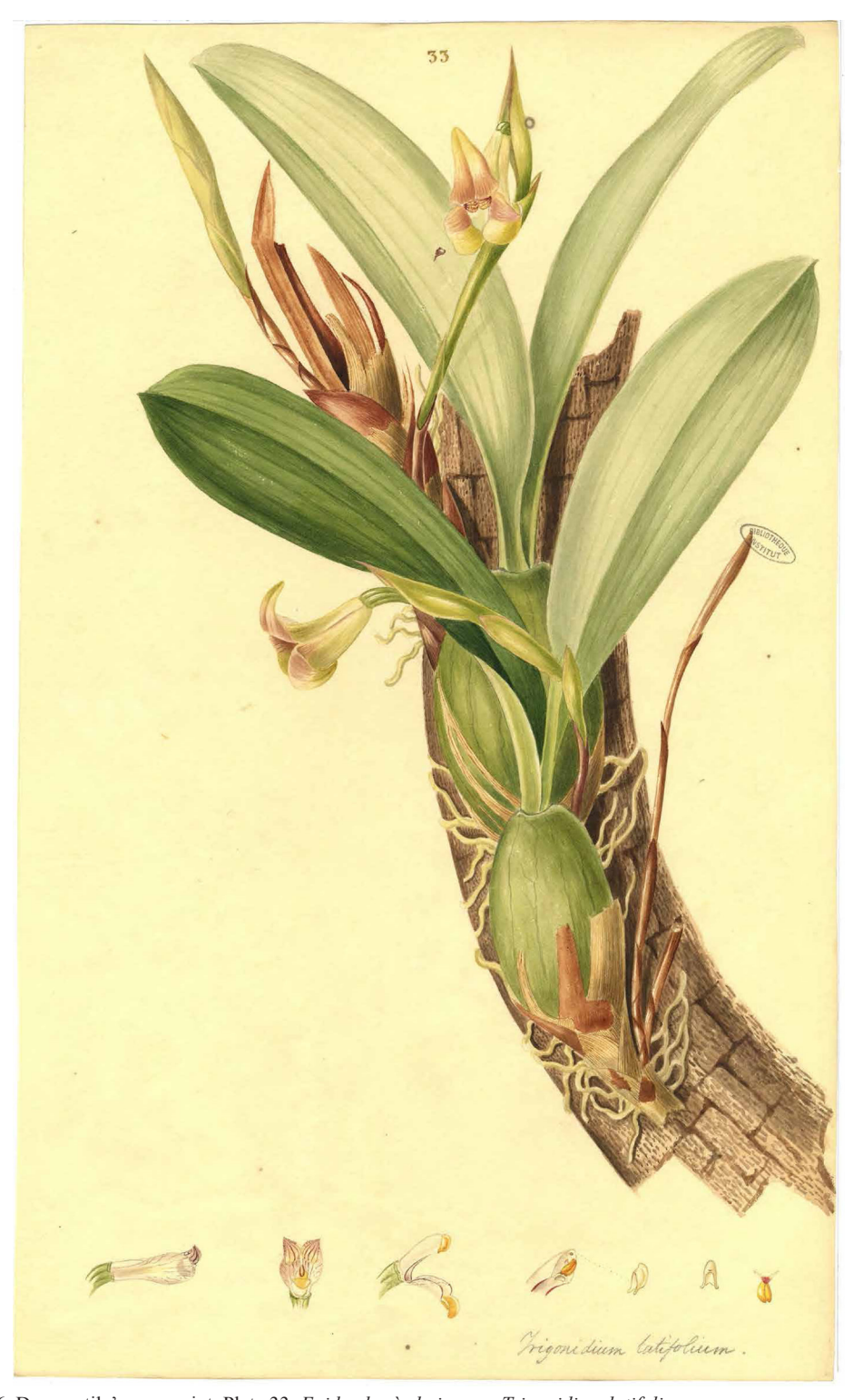
\label{eq:figure 26} \textit{Figure 26. Descourtilz' manuscript. Plate 33: } \textit{Epidendre \`a chainons-Trigonidium latifolium.}