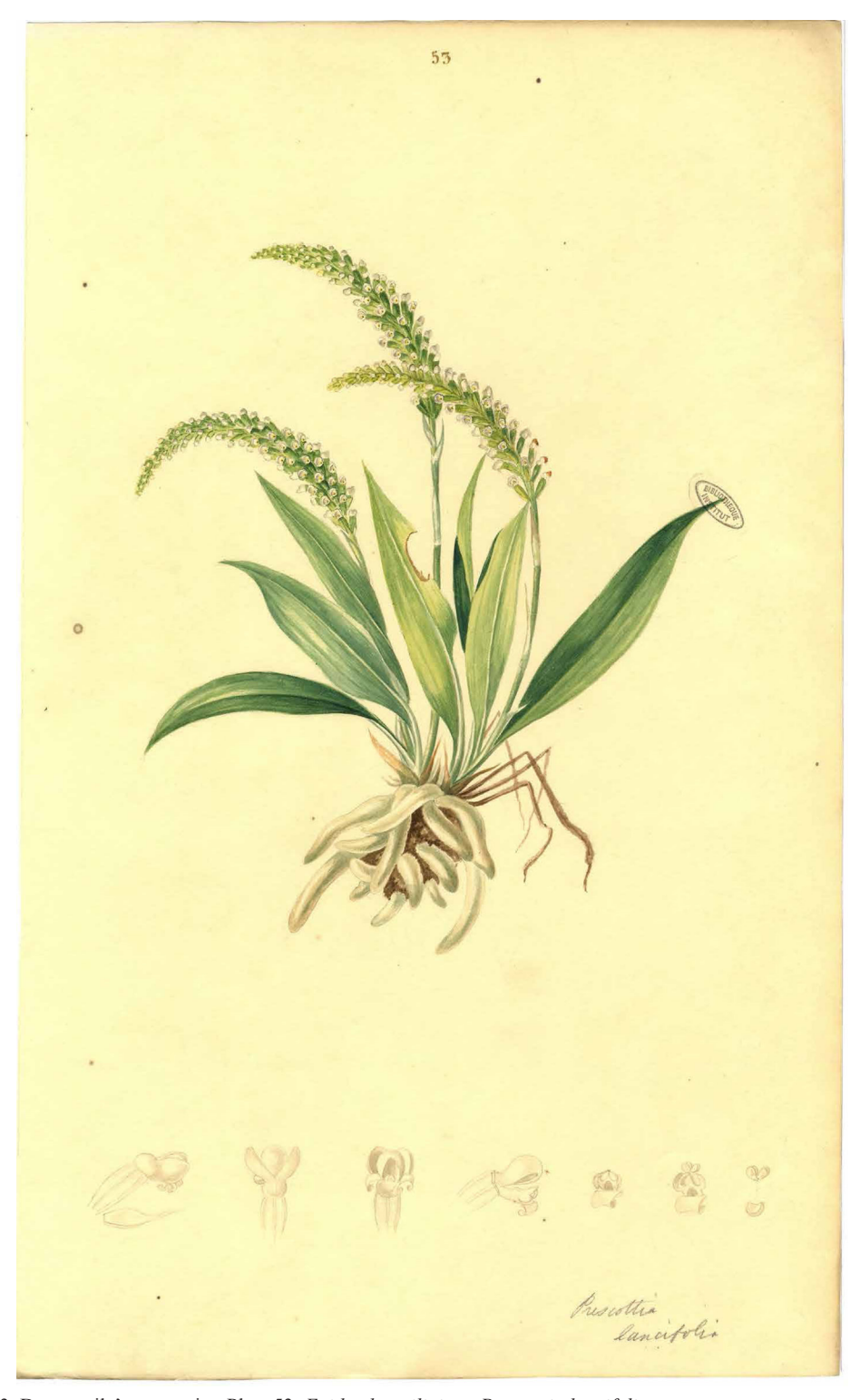
Figure 33. Descourtilz' manuscript. Plate 53: Epidendre miliaire – Prescottia lancifolia .