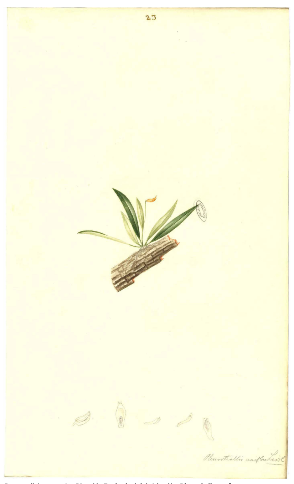
Figure 22. Descourtilz' manuscript. Plate 23: Epidendre bilabié-ligulé – Pleurothallis uniflor.