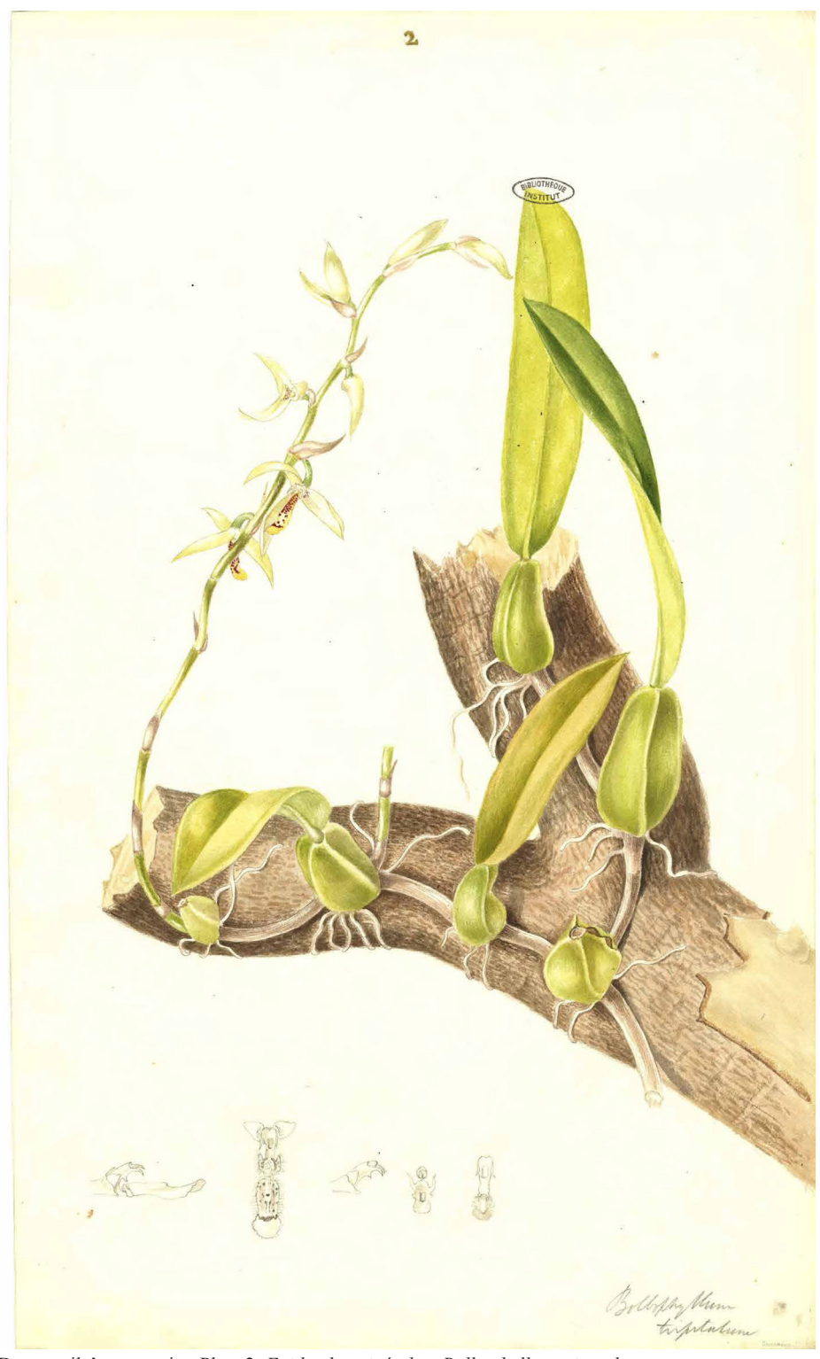
FIGURE 14. Descourtilz' manuscript. Plate 2: Epidendre tripétale – Bolbophyllum tripetalum.