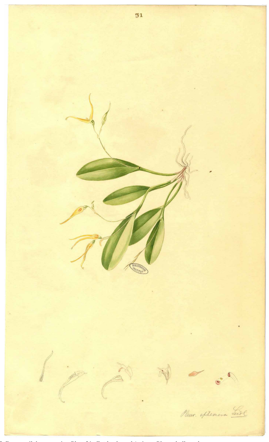
Figure 25. Descourtilz' manuscript. Plate 31: Epidendre ephêmère – Pleurothallis ephemera.