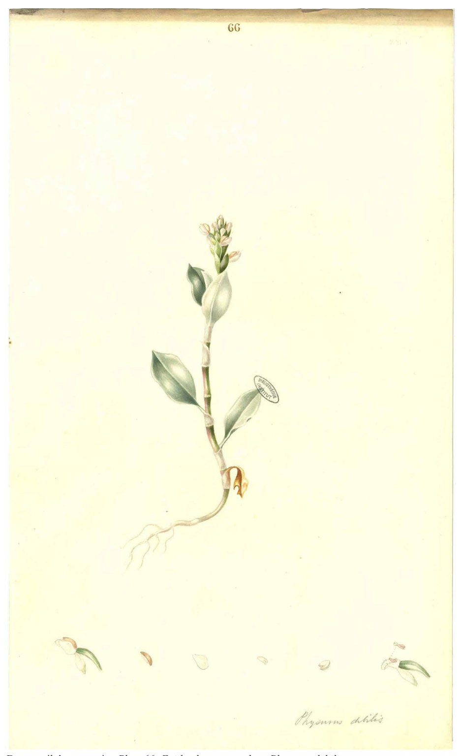
Figure 40. Descourtilz' manuscript. Plate 66: Epidendre amaranthe – Physurus debilis .