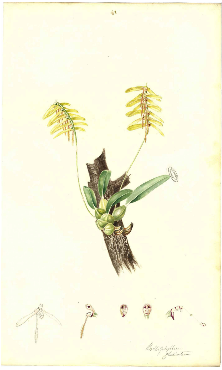
Figure\ 29.\ Descourtilz'\ manuscript.\ Plate\ 41:\ \textit{Epidendre porte-glaive-Bolbophyllum gladiatum}.