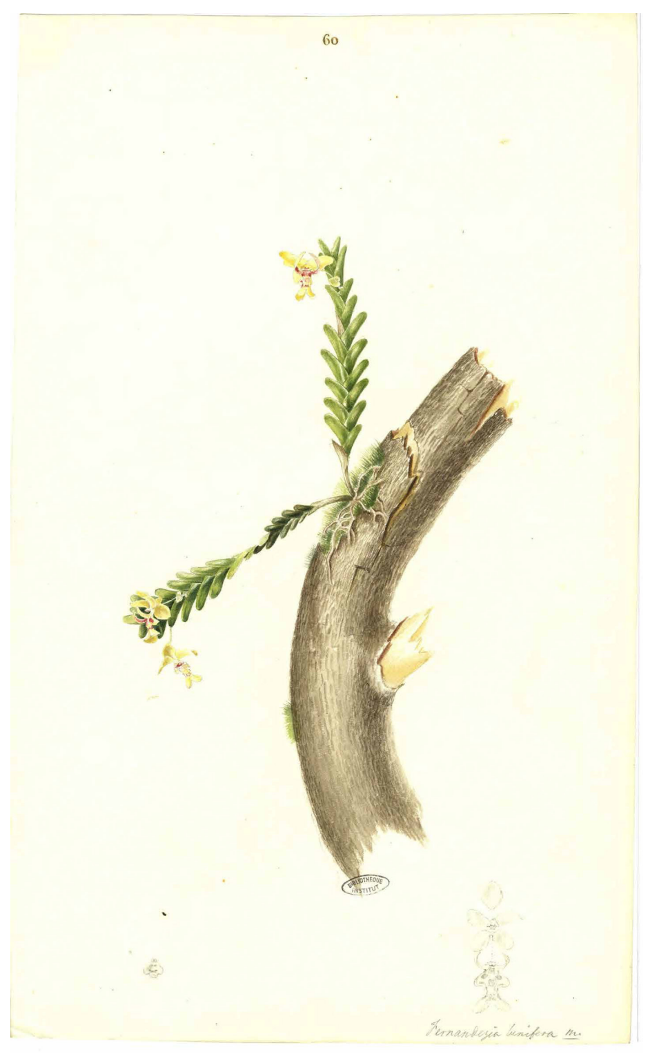
\label{thm:prop:control} \mbox{Figure 35. Descourtilz' manuscript. Plate 60: } \mbox{\it Epidendre antropomorphe-Fernandezia lunifera.}