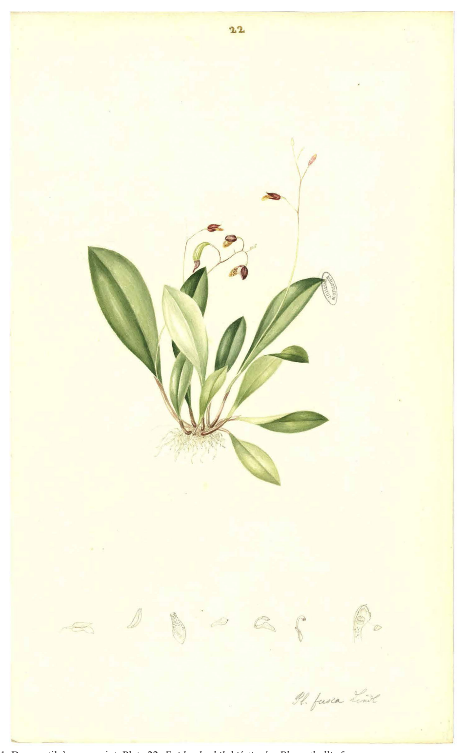
\label{eq:figure 21} \textit{Figure 21. Descourtilz' manuscript. Plate 22: } \textit{Epidendre bilabi\'e-tigr\'e} - \textit{Pleurothallis fusca.}