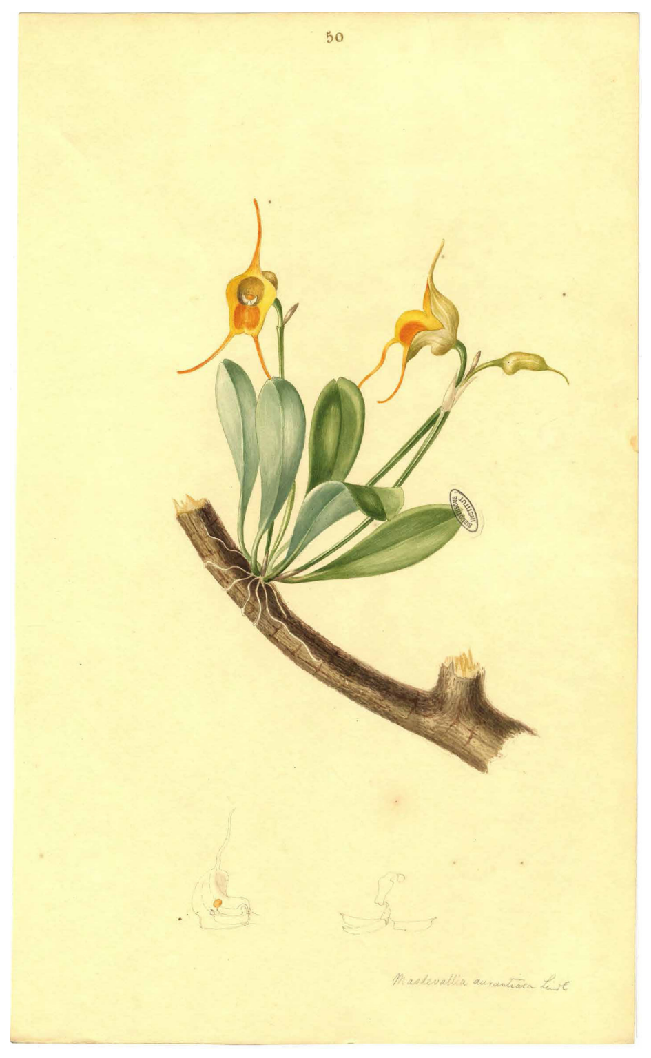
FIGURE 31. Descourtilz' manuscript. Plate 50: Epidendre cirrhifère-aurore – Masdevallia aurantiaca . LANKESTERIANA 17(3), December 2017.