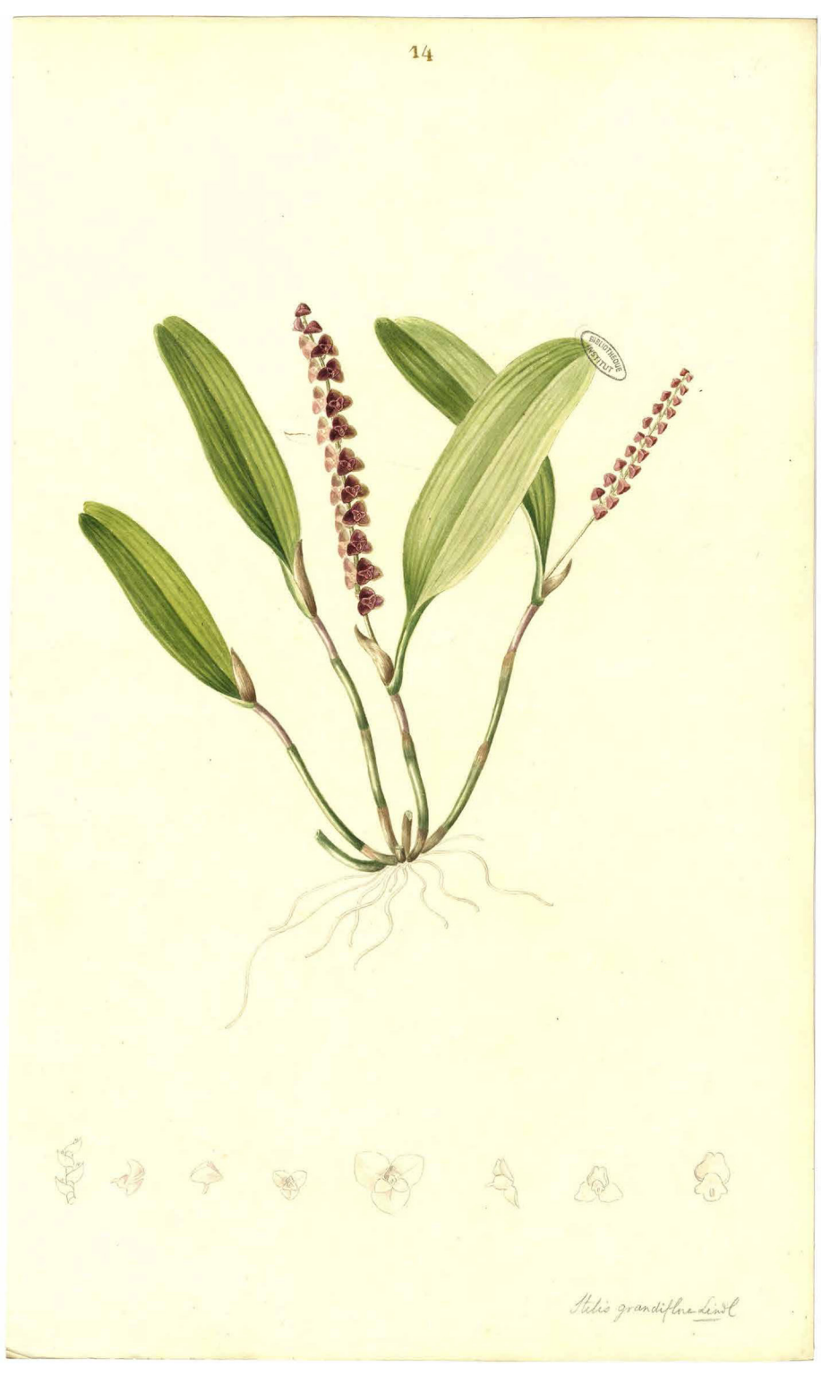
Figure 18. Descourtilz' manuscript. Plate 14: Epidendre heteracé – Stelis grandiflora .