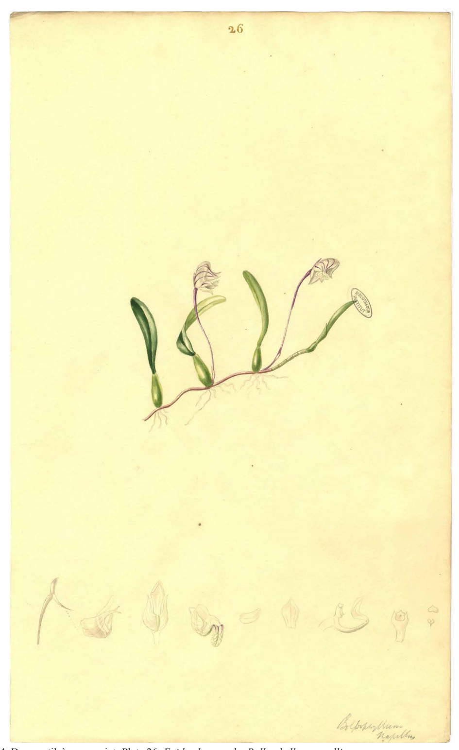
\label{prop:control} \textit{Figure 24. Descourtil2' manuscript. Plate 26: } \textit{Epidendre napel-Bolbophyllum napelli.}