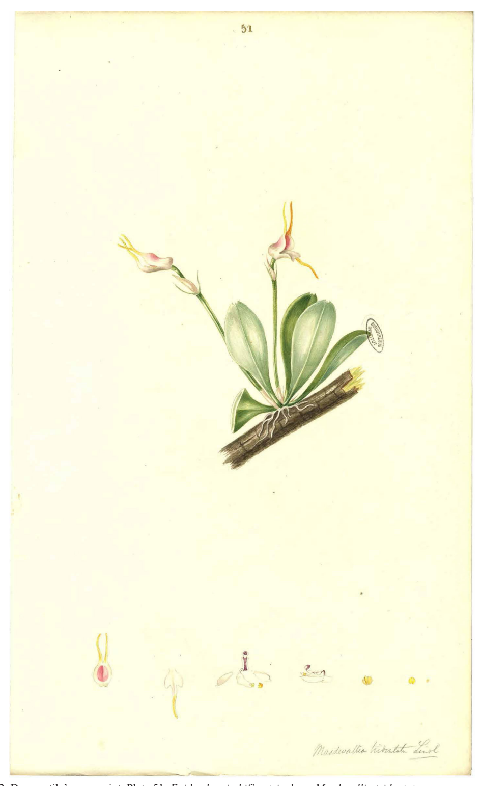
\label{thm:prop:prop:special} Figure~32.~Descourtilz'~manuscript.~Plate~51:~\textit{Epidendre cirrhifère-tricolor}-\textit{Masdevallia tridentate}.