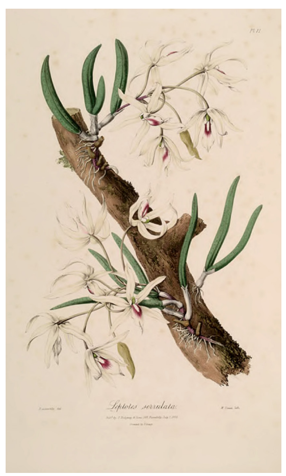
FIGURE 12. Sertum Orchidaceum. Plate 40: Leptotes serrulata.

by Descourtilz. And even Kew shows only two obscure and badly prepared specimens of Huntleya meleagris and Plerothallis fusca , attributed to Descourtilz, and a pencil sketch of Trigonidium latifolium , supposedly by Robert Allan Rolfe, which is an exact copy of plate 33 of Descourtilz' manuscript (Fig. 41).