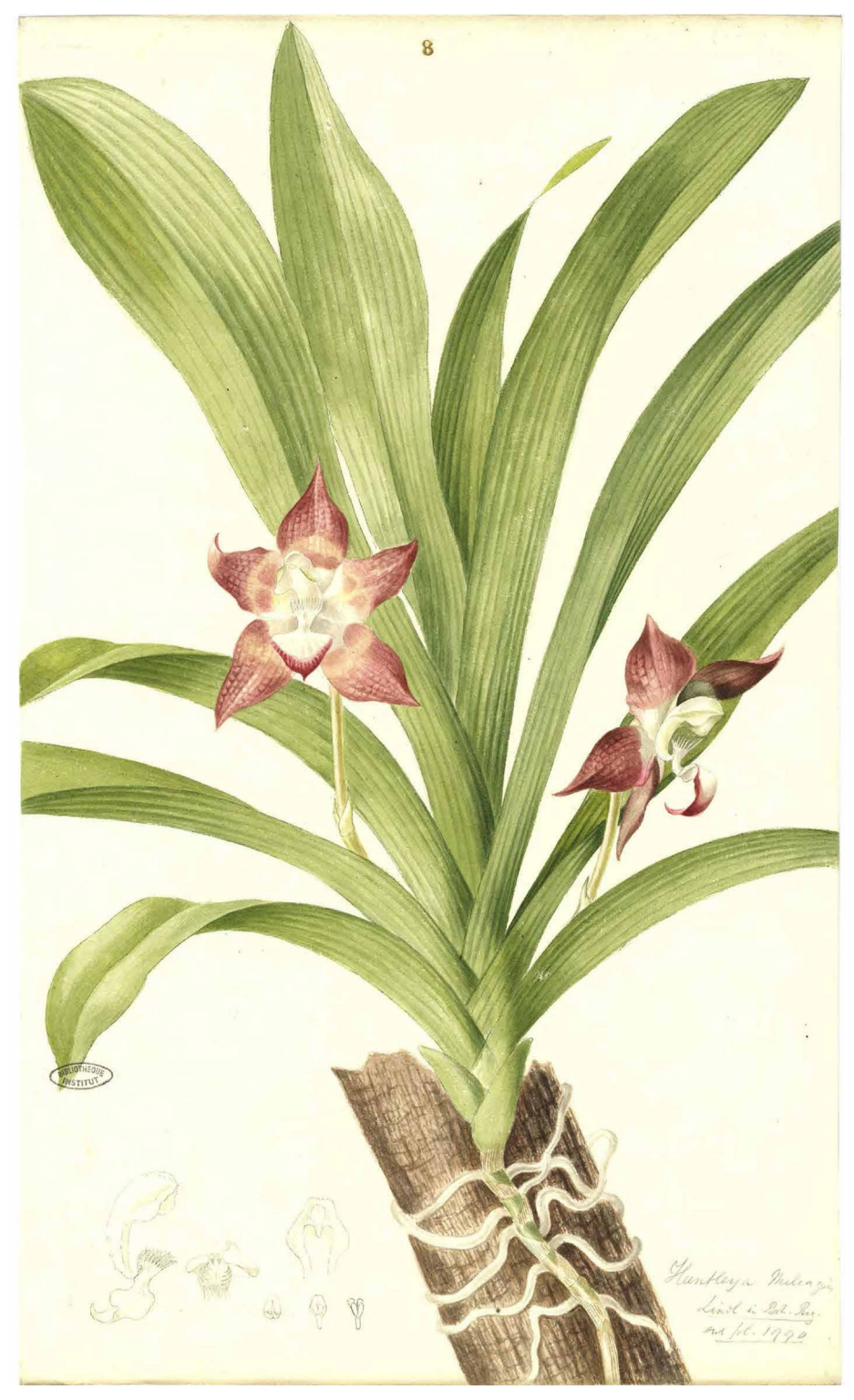
\label{eq:Figure 16.} Figure \ 16. \ Descourtilz' \ manuscript. \ Plate \ 8: \textit{Epidendre fritill\'e} - \textit{Huntleya meleagris}.