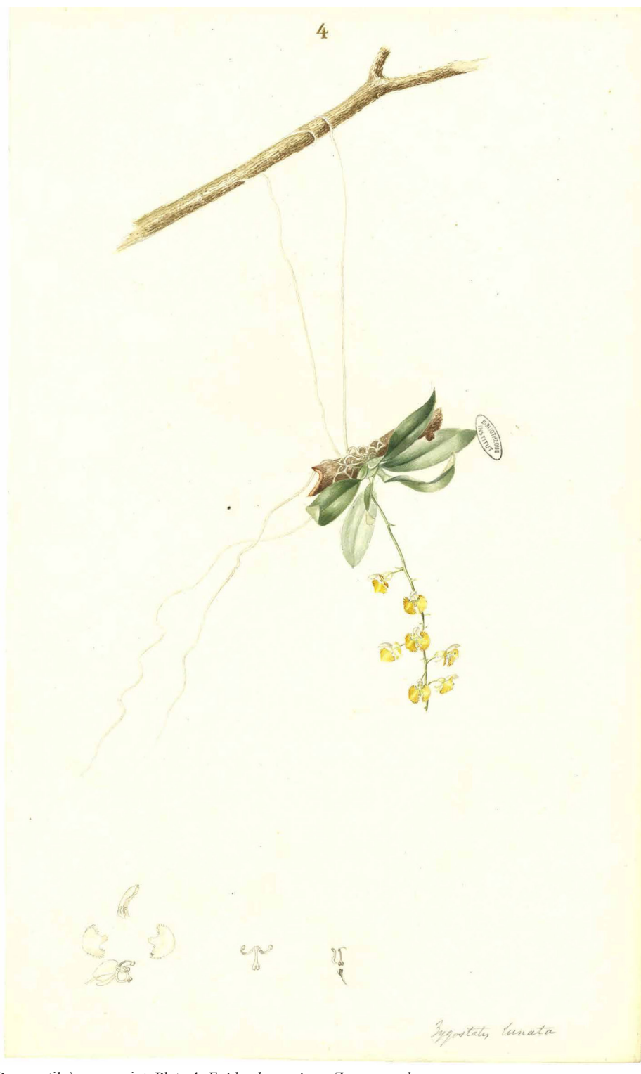
Figure 15. Descourtilz' manuscript. Plate 4: Epidendre aerien – Zygostates lunata .