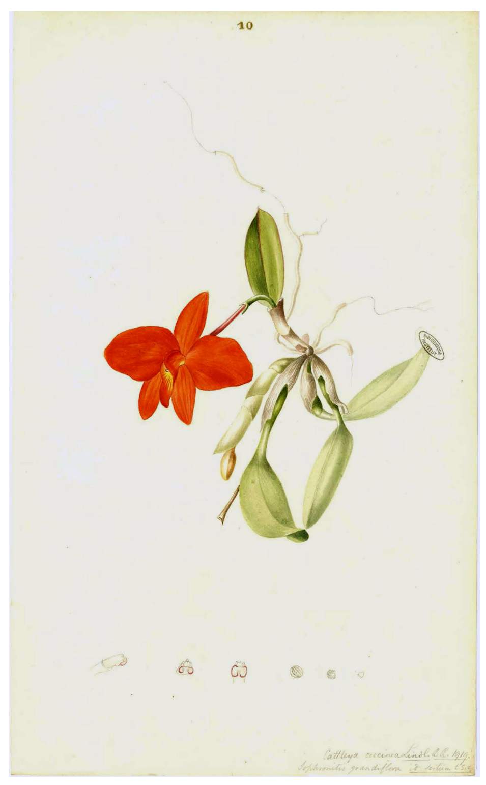
FIGURE 8. Descourtilz' manuscript (fragment). Plate 10: Epidendre ponceau.