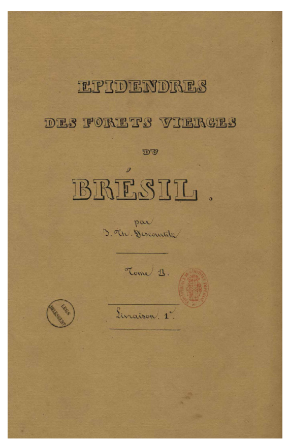
FIGURE 6. Title page of Descourtilz' manuscript.

As we will see later, Lindley described quite a few new species based on Descourtilz' drawings. In his descriptions, Lindley often mentioned the original French names given by Descourtilz to his species (using always the name Epidendre for all species, and never once using the family name Orchideae or Orchidaceae ) and sometimes also the plate number used by Descourtilz. With no exception, both name and plate number coincide with the unpublished manuscript which we now have the possibility to study. The manuscript held at the Institut de France is the same that Delessert gave on loan to Lindley in 1836.