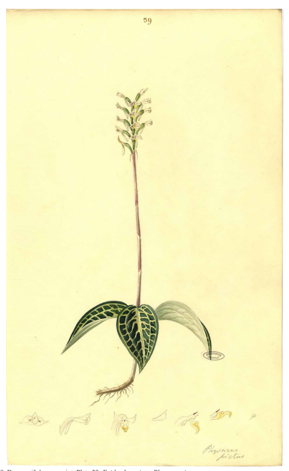
\label{eq:Figure 28. Descourtilz' manuscript. Plate 39: \textit{Epidendre peint-Physurus pictus}.