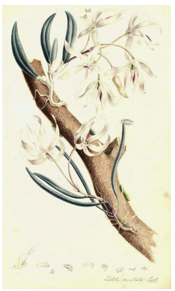
Figure 13. Descourtilz' manuscript (fragment). Plate 28: Epidendre ficoïde .

In the late 1840s or early 1850s, Descourtilz was sent by the Brazilian Government to the province of Espírito Santo, the north-east of Rio de Janeiro, to investigate the animal life and to report on precious minerals. He discovered traces of gold and iron in the vicinity of the village Laurinha, created by the provincial government to house and proselytize the Puri Indians. However, the ill-treatment suffered by the Indians drove them away and led to the decay of the village. At the site there was a village that