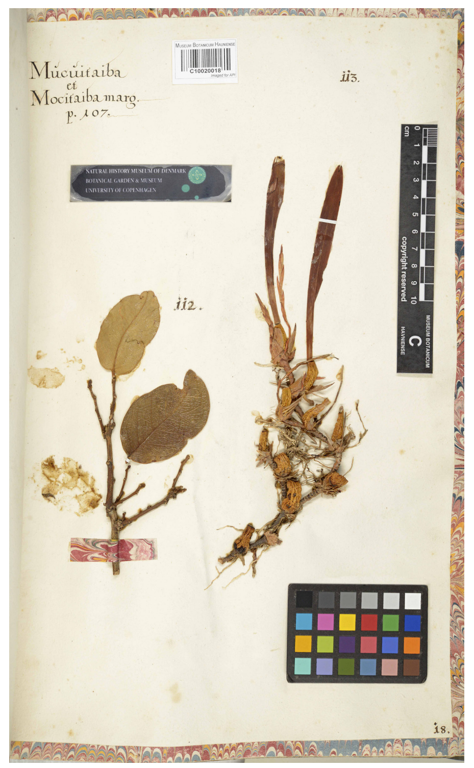
FIGURE 14. Page 18 of Marcgrave's herbarium.