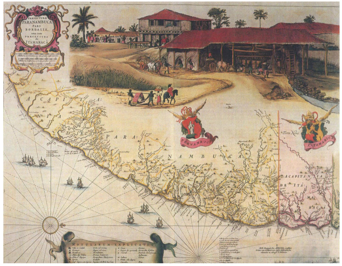
FIGURE 8. Map of the coast Pernambuco by Post and Marcgrave.

the same edition of 1648, but in the volumes written by Marcgrave (Marcgrave 1648) (Fig. 11) where it was described by him as Urucatú Brasiliensum . Both names used by Piso and Marcgrave, Tupaipi and Urucatú , belong to the language of the Tupinambá tribe of the Amazonas region (Alcántara Rodríguez