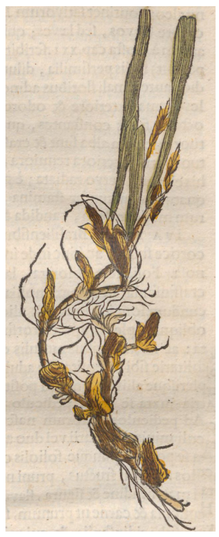
FIGURE 12. Marcgrave's illustration of Trigonidium acuminatum in page (M)107 of his 1648 edition of Historia Naturalis Brasiliae .