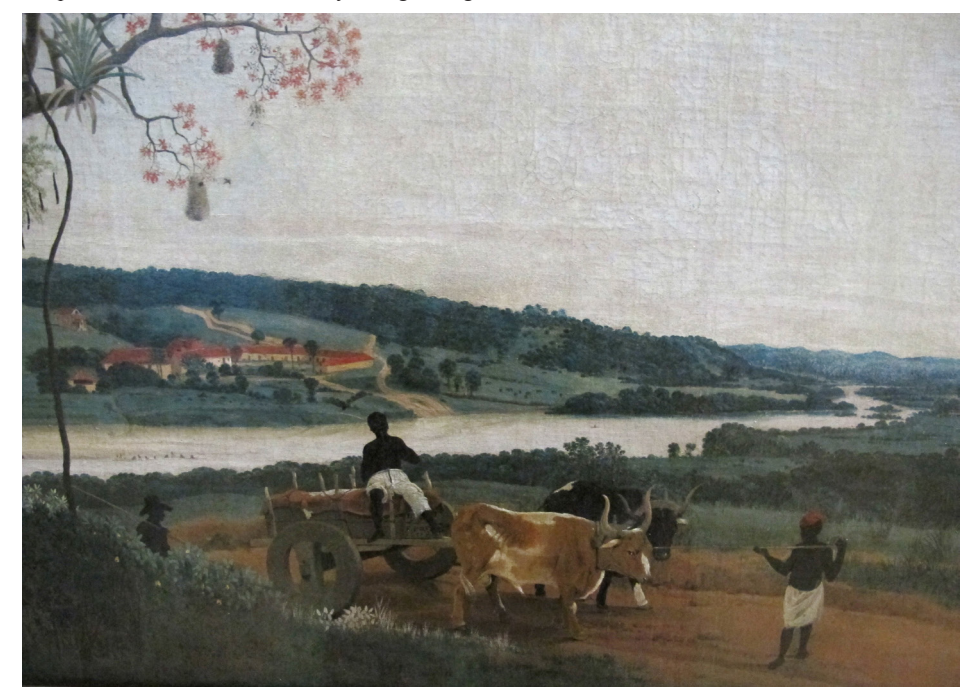
FIGURE 4. Brazilian landscape with oxcart by Frans Post (1838).