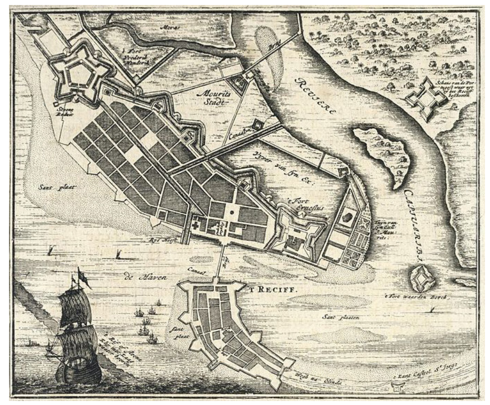
FIGURE 3. Map of Recife and Mauritsstad. By Georg Marcgrave.