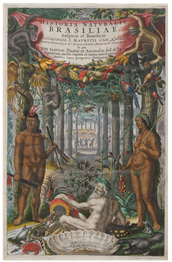
FIGURE 6. Frontispiece of Piso's first edition (1648).

Caribbean. In the 1630s, Brazil provided 80% of the sugar sold in London, while by 1690 it only provided 10%. The Portuguese colony of Brazil did not recover economically until the discovery of gold in southern Brazil during the 18th century.