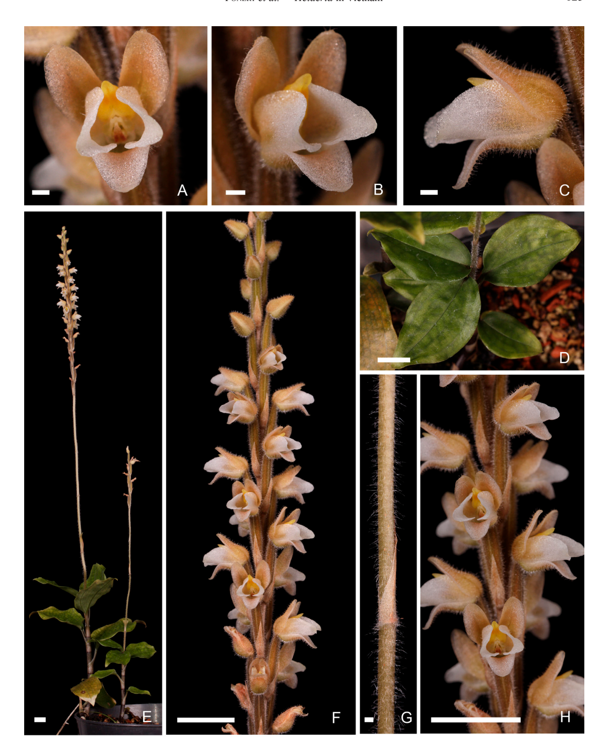
FIGURE 1. Hetaeria finlaysoniana . A. Flower from the front. B. Flower. C. Flower from the side. D. Leaves. E. Habit. F. Inflorescence. G. Peduncle with sterile bract. H. Closeup of the inflorescence. Scale bars: A, B, C, G = 1 mm; D, E, F, H = 1 cm. Cultivated in Prague Botanical Garden (Leg. J. Ponert 523, PRC!).