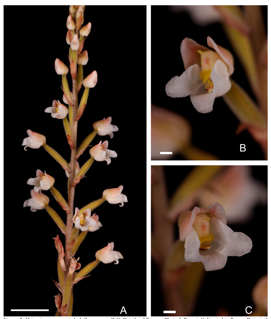
Figure 2. Hetaeria youngsayei . A. Inflorescence. B-C. Details of flowers. Cultivated in Prague Botanical Garden (Leg. J. Ponert 524, PRC!).

reported from Thailand, Hainan and Hong Kong but not yet from Cambodia or Laos which lie between Vietnam and Thailand. Our collection shows that this species may be distributed not only in northern part of Vietnam, but more likely in nearly the whole country,