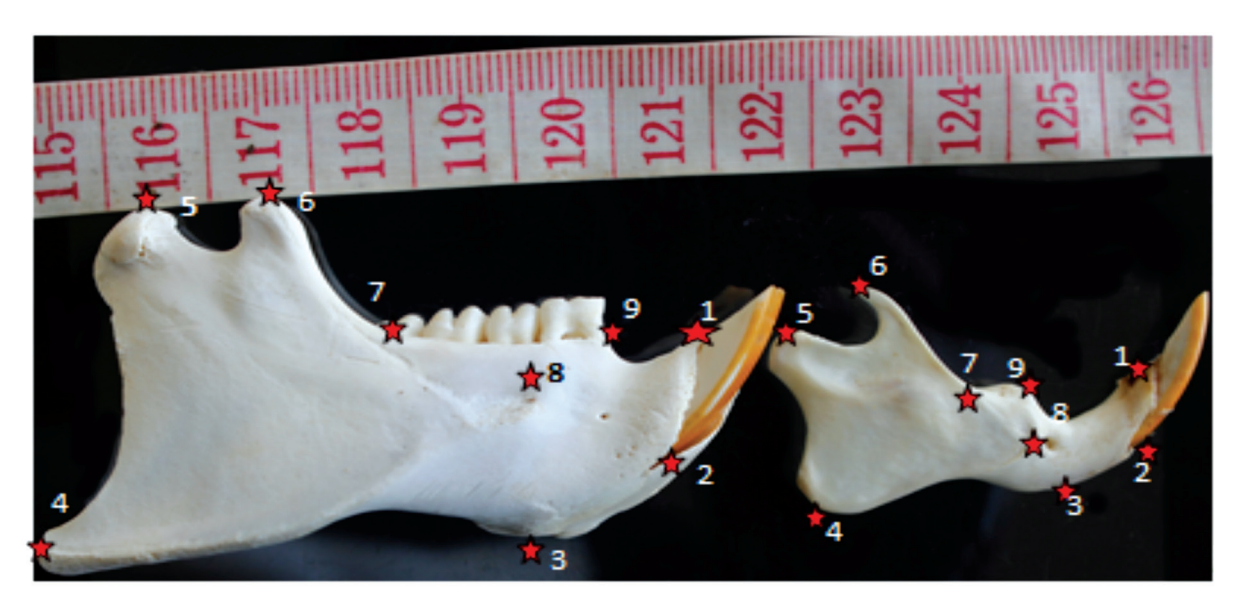
Fig 1. Right lateral mandible view of Thryonomys swinderianus and Cricetomys gambianus (left to right) with 9 landmark points. Numbers correspond to definitions in Table 1.

Photography: Pictures of right hemi-mandibles (on their lateral aspect) were taken using a digital camera Canon EOS1200D, (Canon Inc. Tokyo Japan) equipped with EFS 18-58mm telephoto and Hama® tripod with stabilizer. Images were taken at a DIN of 25cm, a focal axis of 5.6, a speed of 200 and sensitivity of 1/500 for all pictures taken. The landmarks assessed on each digital picture were 9 in number (Figure 1 and Table 1). Landmarks used