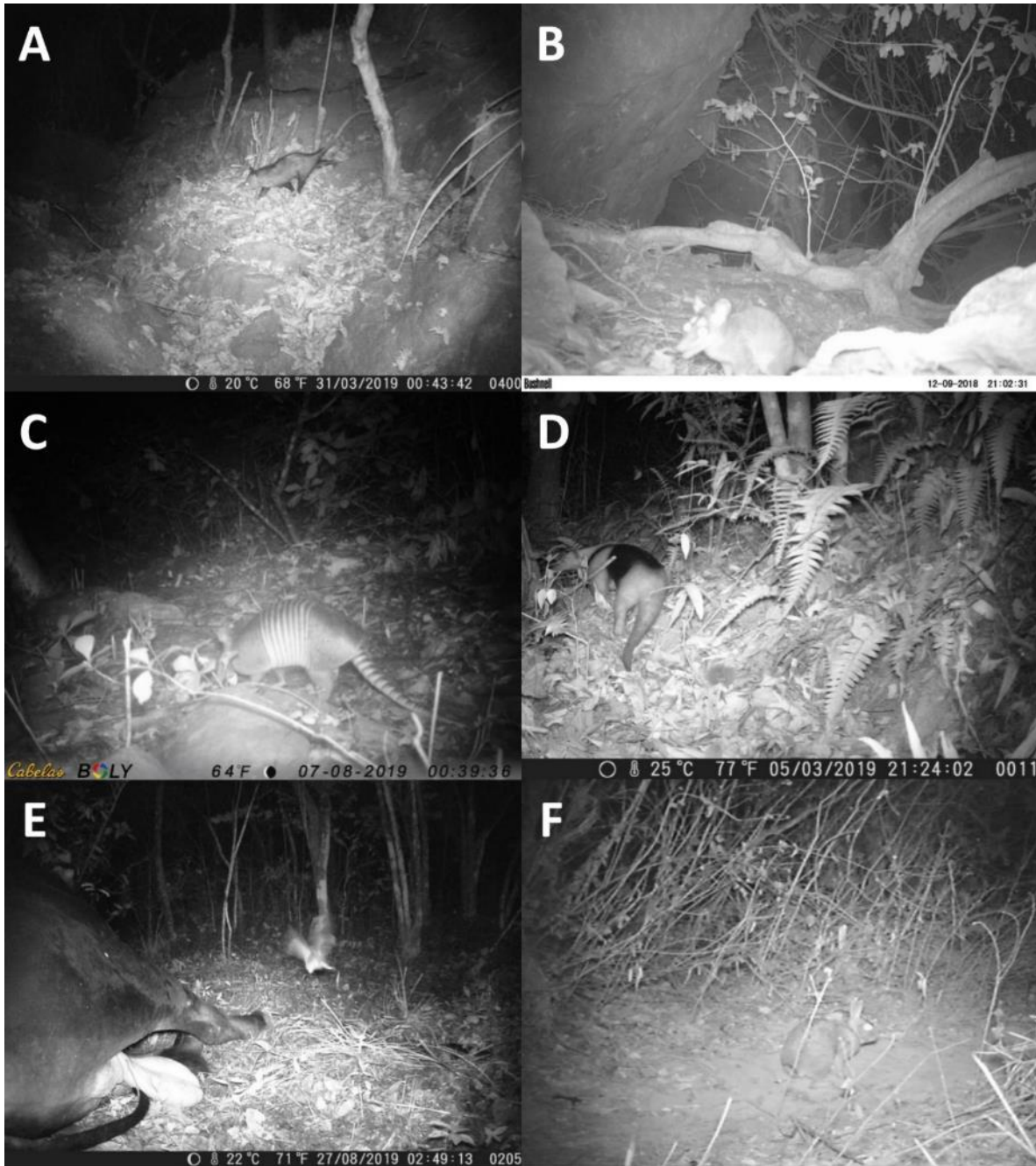
Fig. 2. Species identified in camera traps: A) Didelphis marsupialis , B) Philander opossum , C) Dasypus novemcinctus , D) Tamandua mexicana , E) Desmodus rotundus flying over a cow inside the forest, and F) Sylvilagus floridanus .